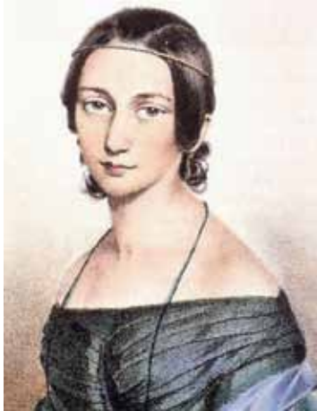
Clara Schumann (1819-1896), composer and pianist.