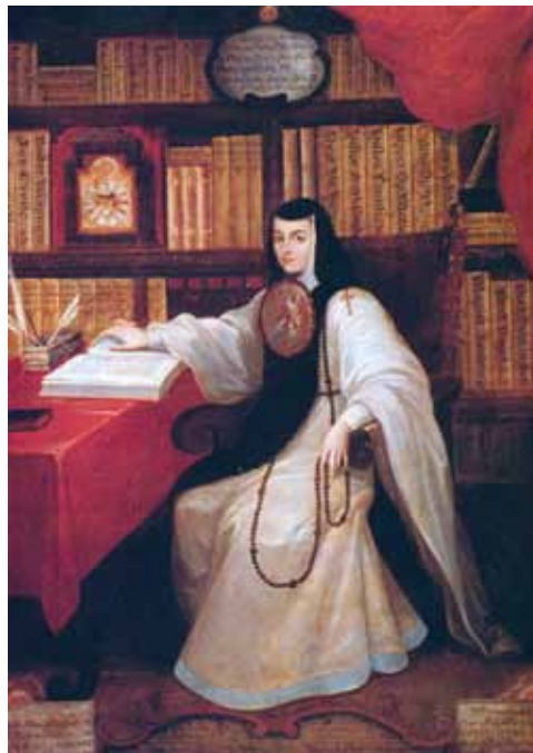
Sister Juana Inés de la Cruz (1651-1695), a self-taught scholar and poet, and nun in Mexico.

greater affinity to beauty adds grace to every undertaking, and succeeds in putting her contemporaries in a positive frame of mind, making their souls more receptive to receiving the truth.