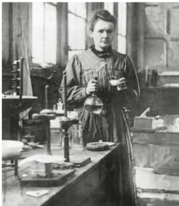
Marie Curie (1867-1934), the Polish-French scientist who pioneered work in radioactivity.

Schiller says, and I agree with him, that the male puts up with an insult to his taste, as long as the inner content of a matter satisfies his mind. Usually he even appreciates it all the more if the essence of the matter emerges more firmly, and the essential is separated from the outer appearance. But the female doesn't forgive the neglected appearance; even if the content is rich, she demands that the form in which that content appears correspond to that richness, and that an outward appearance which does not fulfill the requirements of the aesthetical sen-