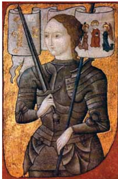
Jeanne d'Arc (1412-1431) in a miniature done in the Fifteenth Century.

Schiller says the female gender has naturally a greater affinity to beauty, and should be called “the beautiful gender,” not so much because of its outer beauty, which he calls “architectonic beauty”—which is a gift of nature but not the accomplishment of the person, as differentiated from the beauty of the soul—but because of the response of