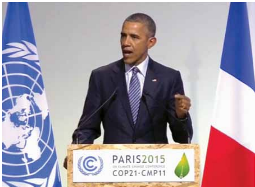
White House video

Barack Obama's head explodes, because he's in on the supervillain's dastardly plot. Seriously,