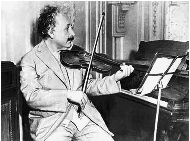
The genius Albert Einstein

Don’t be practical; practical people are stupid