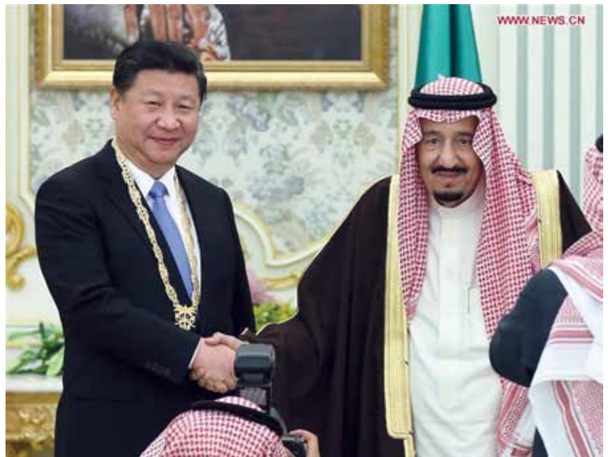
Xi Jinping wears the Abdulaziz Medal he has just been awarded by Saudi King Salman bin Abdulaziz Al Saud.

But this New Silk Road, or what the Chinese call the Silk Road Economic Belt and the Twenty-first Century Maritime Silk Road, is not simply a project for economic cooperation, but rather is a new paradigm for relations between sovereign nations. The strategic significance of the Silk Road narrative is not lost on the