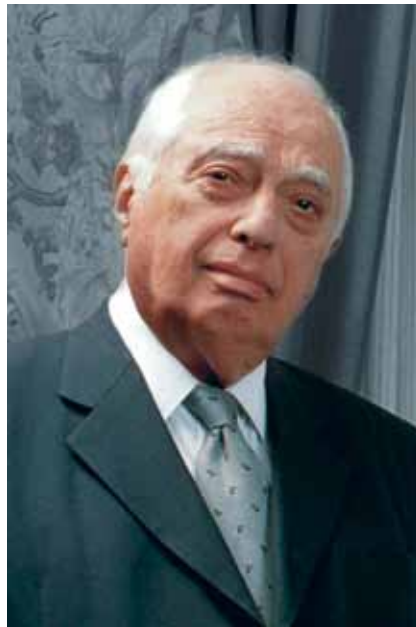
Standard You Tube License

In October 2014, on the occasion of the 85th birthday of former Russian Prime Minister Yevgeny Primakov, Russian Foreign Minister Sergey Lavrov emphasized the importance of Primakov's role in creating the precursor to what is today known as the BRICS, which was the "Strategic Triangle" of Russia, India, and China, in the late 1990s. He said: