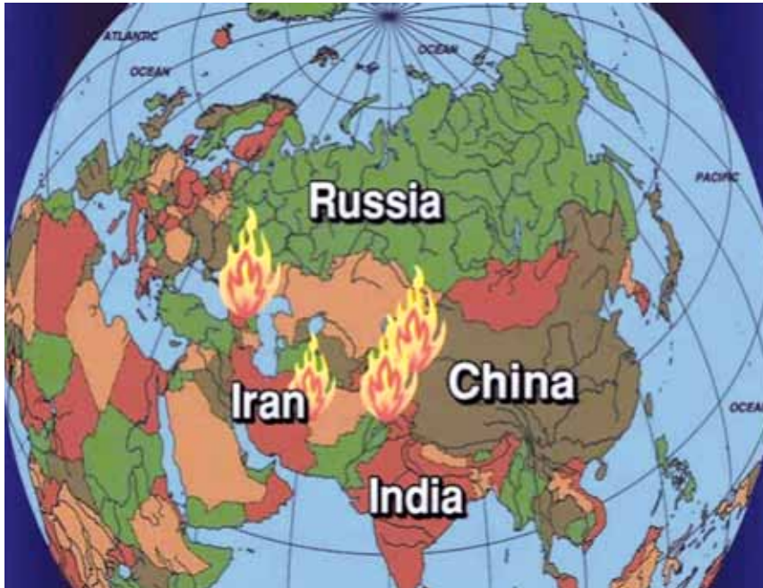
EIR video grab

In a 1999 video, LaRouche warned that British Empire directed mercenaries, posing as Islamic, would ignite conflicts that would prevent collaboration of the Strategic Triangle nations, and ultimately lead to nuclear war.