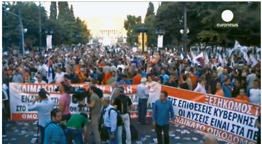
A June 2015 rally against austerity in Greece. Southern Europeans are acutely aware of the danger the City of London-Wall Street policy means for their lives.

Even the City of London's Financial Times is nervous about what they have unleashed, noting that banks that have been bailed in—such as Portugal's Novo Banco—have immediately had their credit rating reduced. That is also expected to happen with any bank that begins to actually market bail-in bonds. Furthermore, the Financial Times admits, smaller banks will be unable to market any bail-in bonds, and will be gob-