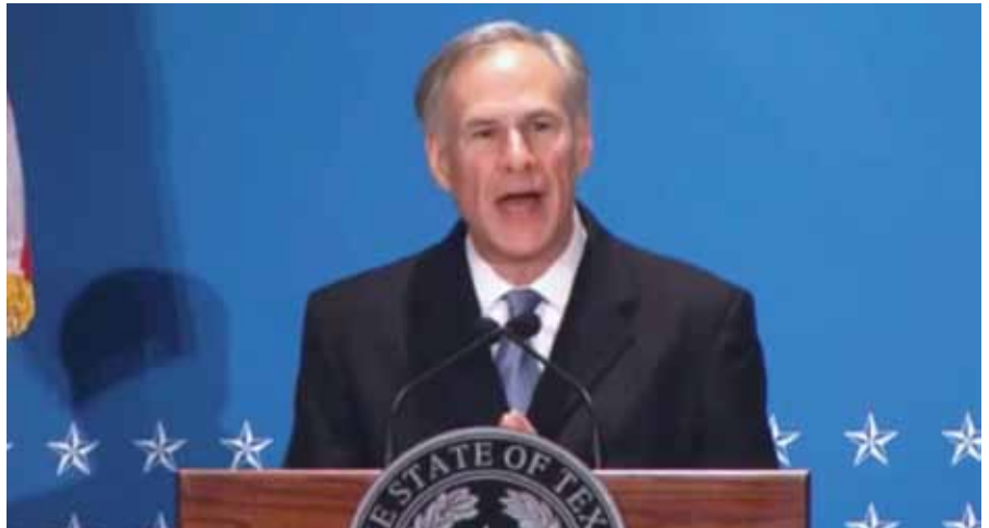
Texas Governor Greg Abbott keynoting the Texas Public Policy Foundation's Annual Policy Orientation on Jan. 8, on his plans to devolve the Constitution.

During his speech, Abbott unveiled what he called the Texas Plan. The plan includes Constitutional amendments “to put teeth into the Tenth Amendment,” which states: “The powers not delegated to the United States by the Constitution, nor prohibited by it to the