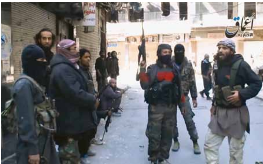
World Conflict News

What I'm saying is that Germany and France and Italy were drawn into this Cold War provocation of sanctions against Russia. This is very much to the detriment of German interests, because German industry is losing more than Russia! Russia can go to China and elsewhere, but Germany is losing export markets forever! So that was very dangerous. And I'm extremely happy, that there was a change after the intervention of