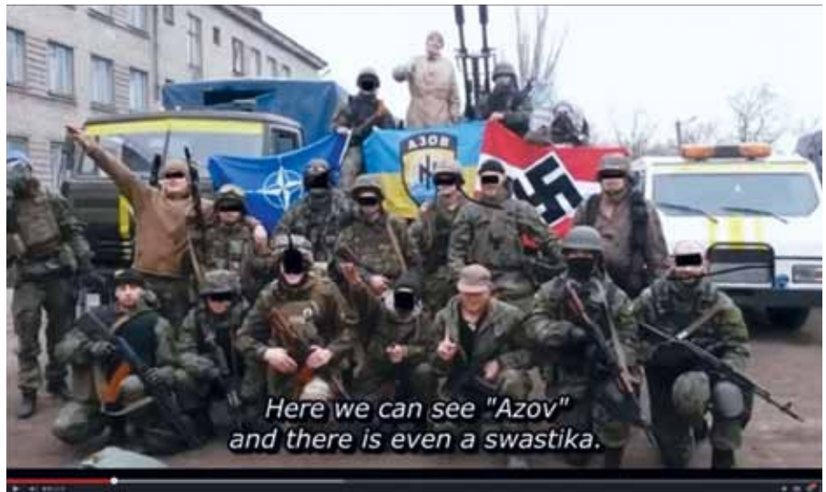
The color revolution in Ukraine: troops of the Azov Battalion. “Were seeing that something similar is starting right now in Moldova! When does this stop?!”

However, the question is, how do we get out of this? Consider how we got into this crisis. Many people warned about this danger, including the former U.S. ambassador to Moscow at the time of the collapse of the Soviet Union, Jack Matlock. In addition, you had such