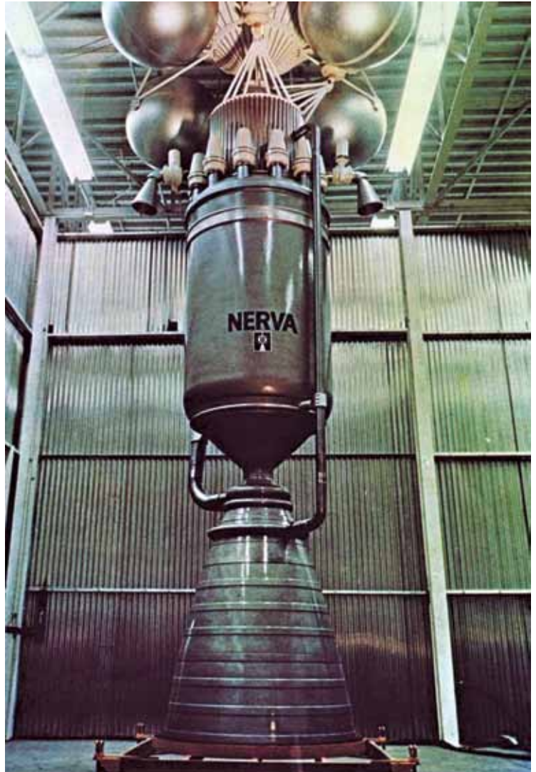
U.S. Atomic Energy Commission

Question: I must say that this latest discussion brought to my mind a very important point, and a thing that's been troubling me for decades , now. My first job when I went to work after graduating from City College in New York, was to work at the National Advisory Committee for Aeronautics (NACA), which became