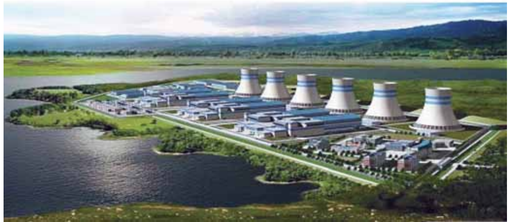
INET/Tsinghua University, Beijing

So we will hopefully get all of you onboard to create a Renaissance movement, because that's what we need. I think we need a Renaissance movement in the United States. It's almost like the famous elephant and the