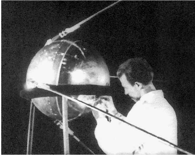
The Soviet Union electrified the world in 1957 by putting a satellite, Sputnik 1, in Earth orbit. "Sputnik challenged our high schools and universities to focus on science, engineering, mathematics. And our lunar landing was the culmination of that." Here, a Soviet scientist prepares Sputnik 1.