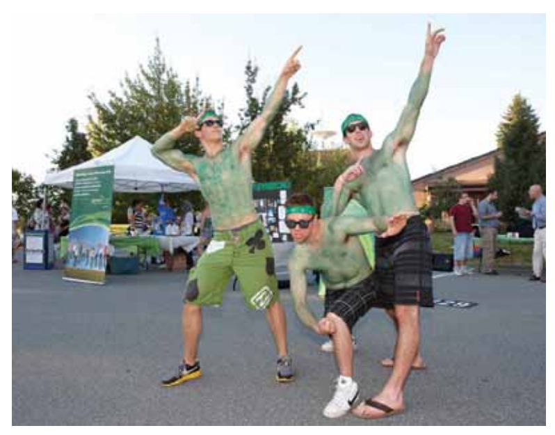
The people of the United States are doomed, doing things in their behavior to destroy the meaning of their lives. Here, one of many tailgate parties before a football game.

I'm raising this because he had this camouflage