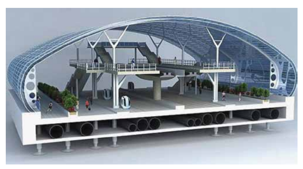
Putin, China, India, represent the way for a new world system. Russia has unveiled plans, a part of which is depicted above, to build a city for 5,000 year-round residents 1,000 miles from the North Pole.

So there is no monotone in this process. The question is the crisis. Are you going to die? Are you going to