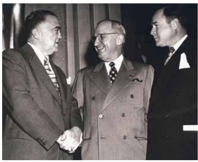
National Law Enforcement Museum