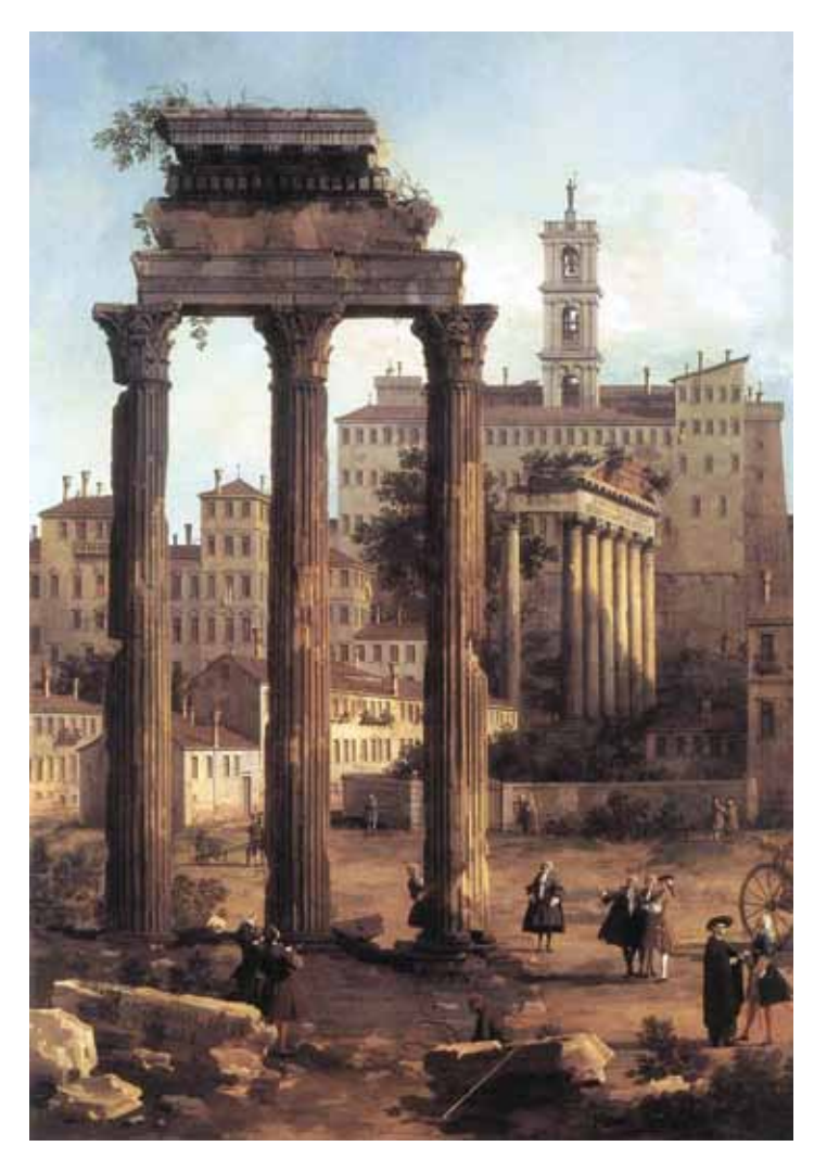
A seismic realignment of human affairs, as unstoppable as the Fifth-century self-destruction of the Roman Empire, is already underway. America must ally with Russia and China against the imperial interests of London and Wall Street. Here, the Ruins of the Forum (1742) by Eighteenth-century Italian master Canaletto.

One of the more despicable features of current trans-Atlantic culture is a Euro-centric or Western-centric view of the world. Many Europeans like to pride themselves that they are not as stupid as Americans, that they are more knowledgeable about world affairs, but the issue here is not knowledge but chauvinism. Almost all Americans and Europeans have an ingrained cultural outlook of a trans-Atlantic-centered world view. European culture, of which the United States is an offshoot,