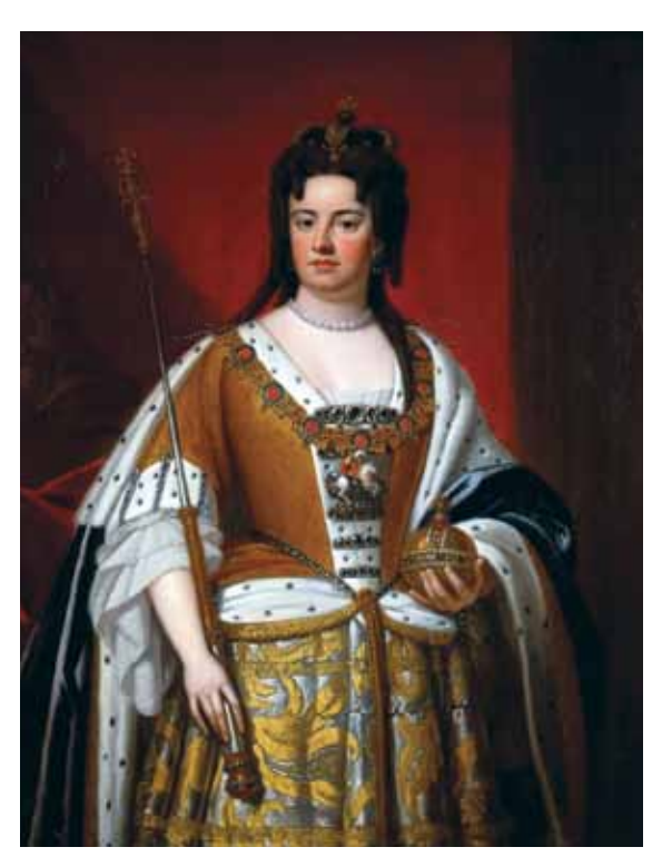
With the death of Queen Anne in 1714, the possibility of a Leibniz-influenced monarchy in Britain also died.

Go back to the early Nineteenth Century, or into the Nineteenth Century, as such, before Bertrand Russell, and the Bertrand Russell effect is the thing that has destroyed the trans-Atlantic community. But Russell was evil. He was successfully evil. And so, therefore, you see the possibility and the implications. The development of the minds of the people, since the beginning of Bertrand Russell's appearance on the screen, has been one of continuing, not even evil, but that kind of force of destruction. People are becoming more and more stupid, more and more insane.