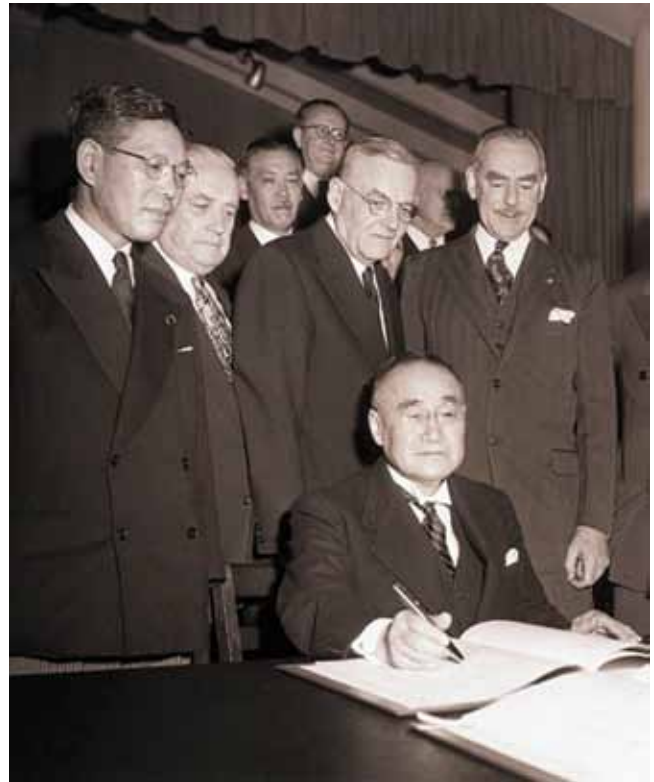
British system/Wall Street operative John Foster Dulles played a leading role creating the conditions for the South China Sea Conflict at the April-June 1945 formation of the UN at the San Francisco Peace Conference, by excluding China from participation. Here, Dulles (standing second from the right) witnesses the Japanese signing of a security treaty with the United States, Sept. 8, 1951, by then Prime Minister Yoshida Shigeru.

The same game was repeated at the San Francisco Peace Conference after World War II, where John Foster Dulles arranged for China to be excluded, despite the fact that China had the highest casualty rate in Asia against the Japanese, and fought the longest. But the Western powers drew the map in Eastern Asia without China, and John Foster Dulles deliberately declared certain Asian frontier territories to be without owners, an old imperial trick to manipulate future conflicts, as was the case with the Sykes-Picot Agreement for Southwest Asia and the 1919 Trianon Treaty for the Balkans.