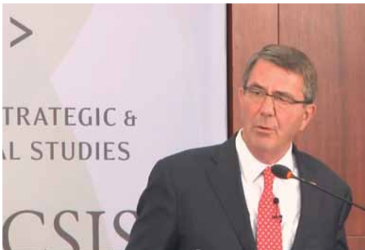
Secretary of Defense Ashton Carter appeared at the Center for Strategic and International Studies April 5, saying that Russia and China are the primary enemies of the United States.

Now where is all of this leading? China's position concerning these waters is written in what it calls the Nine Dash Line in the South China Sea, and China claims that these are territories which historically have belonged to China, including the right to reclaim land and build bases on the Spratly Islands. China also says—and it is true—that this does not represent a violation of the freedom of the seas. It will only improve the living conditions of the people there and improve protection against pirates, without hindering the passage of other ships.