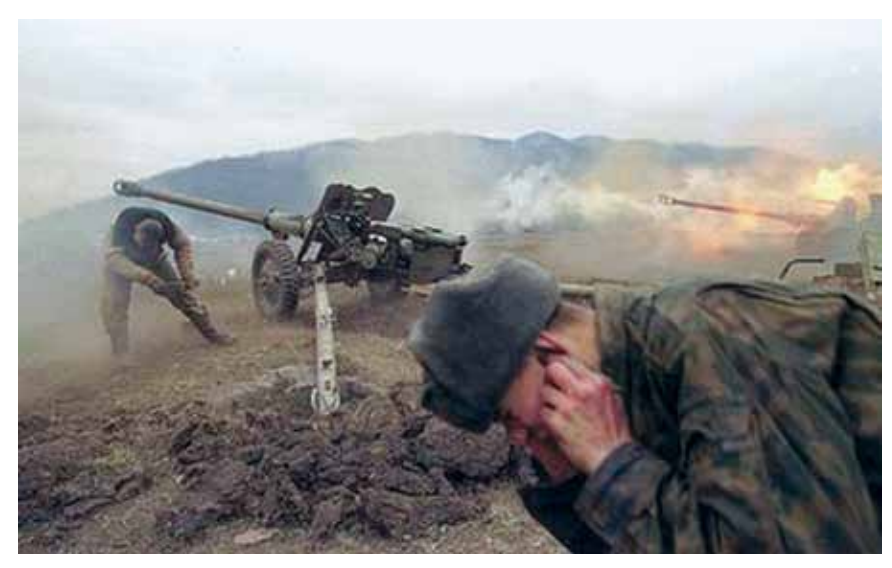
Russian artillery shelling mercenary fighters in Chechnya in January 2000.

Remember that Yevgeny Primakov first set forth the idea of strengthening cooperation in the Russia-India-China (RIC) troika format, which jump-started the evolution of geopolitical structures advocating multi-polarity and the formation of a polycentric world, where all positions and rights are distributed in line with a [coun-