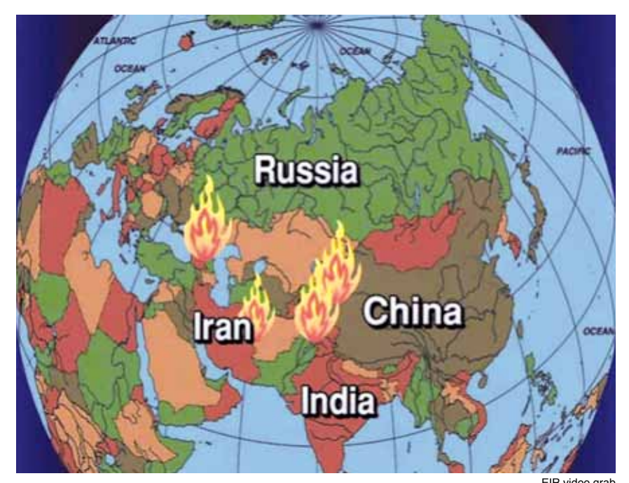
In a 1999 video, LaRouche warned that British Empire directed mercenaries, posing as Islamic, would ignite conflicts that would prevent collaboration of the Strategic Triangle nations, and ultimately lead to nuclear war.

gration of Russia as a nation, or to resort to the means it has, to exact terrible penalties on those who are attacking it, going closer and closer to the source, the forces behind the mercenaries—which include, of course, Turkey, which is a prime NATO asset being used as a cover for much of this mercenary operation in the North Caucasus and in Central Asia.<sup>4</sup>