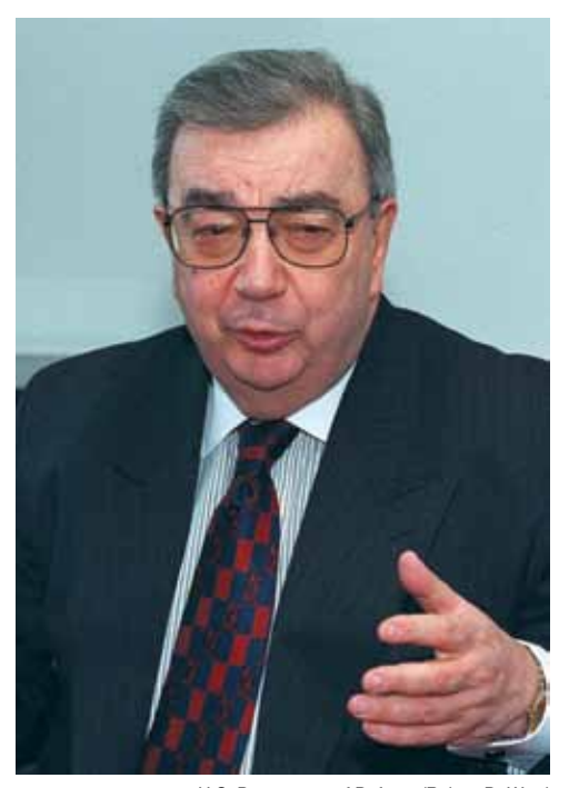
Former Russian Prime Minister Yevgeny Primakov played a key role in establishing the Strategic Triangle of Russia, China, and India, the precursor of today's BRICS.

In a 1999 video presentation called Storm Over Asia , Lyndon LaRouche issued the warning that these British Empire-directed forces would use mercenaries under the banner of Islam to light small fires of conflict, that would spread to regional war, and ultimately to world war using nuclear weapons. In the video presentation, LaRouche said: