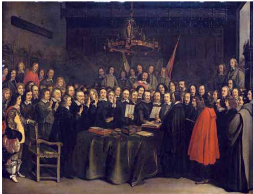
The signing of the Peace of Westphalia (Münster), 1648.

It was Lyndon LaRouche and Helga Zepp-LaRouche who established the dialogue and the policy initiative that have led to the One Belt, One Road pro-