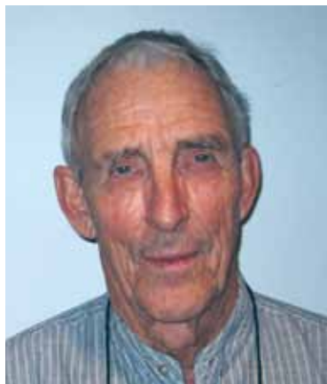
CIA agent Peter Matthiessen, founder CCF's Paris Review.