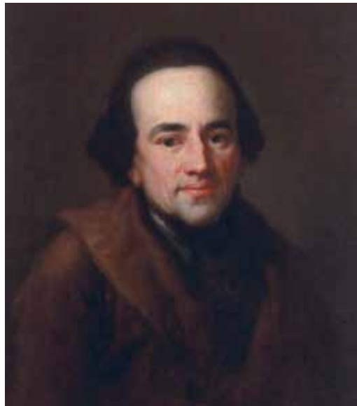
oil portrait (1771) by Anton Graff, University of Leipzig collection Moses Mendelssohn (1729-1786) played an exemplary role in creating the modern European Classical music tradition.