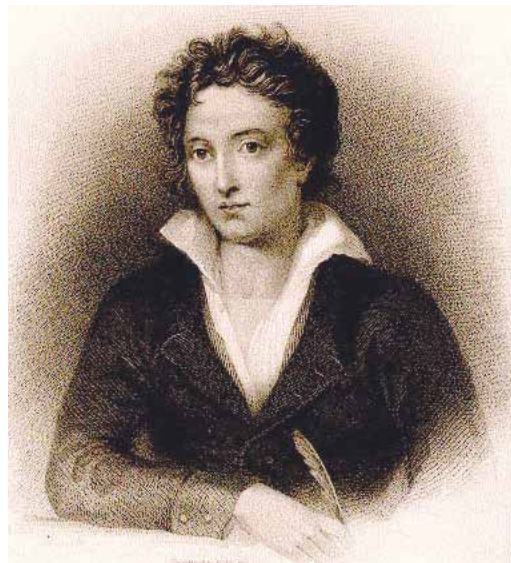
Percy B. Shelley

Now, this isn't done by some act of individual, arbitrary will. It isn't done in the ways that people normally think at all , and I think Lyn is the best one to express the fact that his notion of human identity is not at all the same idea as that which most people have of what is human. The human identity is not biological. What Einstein represents as a thinker, and I think in a different way what Shelley represented as a thinker, is what Lyn often refers to.