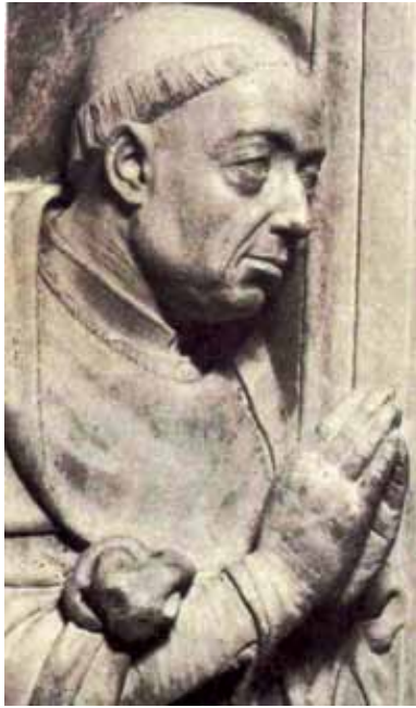
Cardinal Nicholas of Cusa, 1401-1464.

So what was the beginning, the most important step in the new paradigm of the modern times? It was actually the thinking of such people as especially Nicholas of Cusa. He very consciously rejected all the axioms that went along with the Middle Ages and Scholasticism and Aristotle. And he said, I'm thinking some-