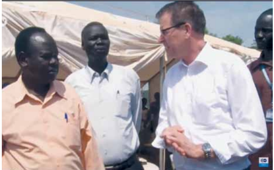
German Development Minister Gerd Müller at a South Sudan refugee camp.

The Syrian government had to resort to a military solution, with the support of Russia and Iran, to free Aleppo and other parts of Syria from ISIS, al-Nusra, and other terrorist groups, because Obama's continued arming of such groups ruled out any other possibility. Anyone who speaks of the "fall" of Aleppo, and not its liberation, is apparently siding with ISIS, the group re-