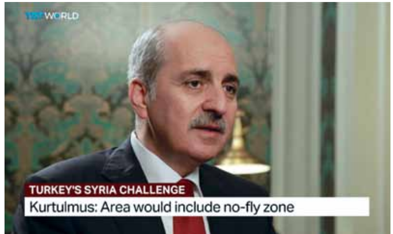
Turkish Deputy Prime Minister Numan Kurtulmus

Hinting at the possible role of western intelligence services in the Istanbul attack, Deputy Turkish Prime Minister Numan Kurtulmus suggested that “foreign intelligence services” could be behind the attack, considering how “professionally” it was carried out. “I am of the opinion that it’s not possible for the perpetrator to have carried out such an attack without any support. It seems like a secret service thing. All these things are