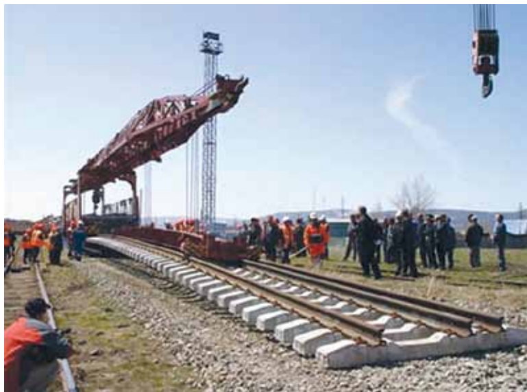
Segment of Baku-Tbilisi-Kars railway under construction.

On Jan. 3, Turkish Transportation Minister Arslan announced that Turkey, Azerbaijan, and Georgia will have completed the Baku-Tbilisi-Kars railway by mid-2017. “We will finish the Baku-Tbilisi-Kars railway project in mid-2017 and the railway will go into service,” said Arslan, adding that the project will link London with Beijing by opening a southern route of the New Silk Road, which would potentially be faster than the current northern route.