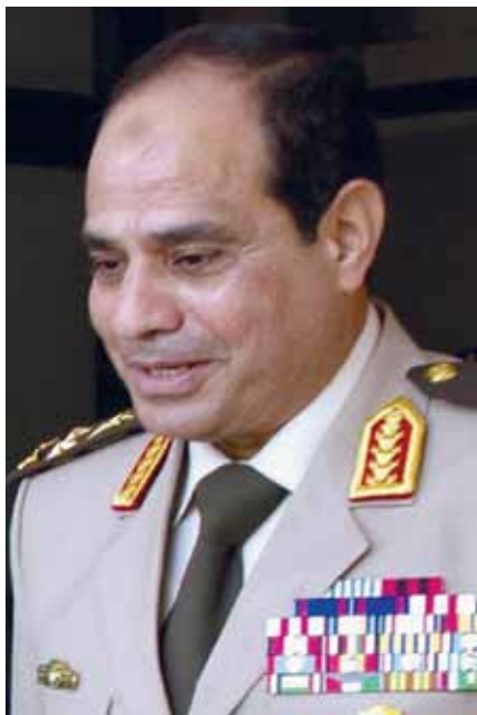
Egyptian President Abdel Fattah el-Sisi.