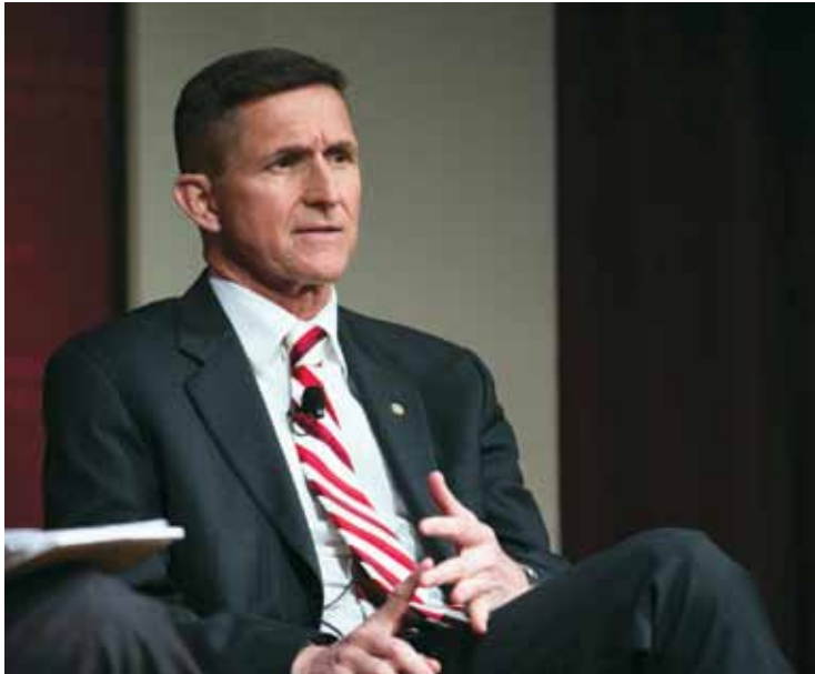
Defense Intelligence Agency