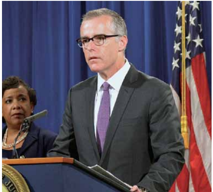
U.S. Federal Bureau of Investigation