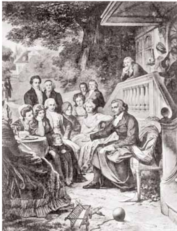
Friedrich Schiller in discussion with friends.

Jones also recalled the attempt by Lyndon LaRouche to bring President Reagan, who had adopted LaRouche’s concept of the Strategic Defense Initiative, into collaboration with Third World leaders like Indira Gandhi and José López Portillo in order to bring about a New World Economic Order. LaRouche’s influence in the Reagan Administration led to a violent reaction by the neo-conservative circles around Vice President George H.W. Bush, who targeted LaRouche in a government-sponsored witch-hunt, which led to La-