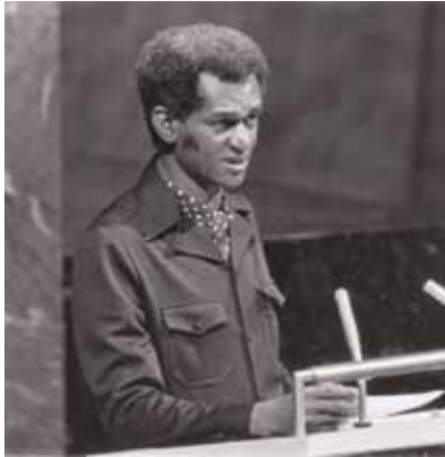
Left: Guyana's Foreign Minister, Fred Wills, at the U.N. General Assembly.