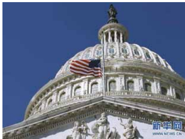
The U.S. Capitol, seat of the Congress.

Apparently it took days for the relevant circles in Germany and Europe to recover from the shock of realizing that this legislation also constitutes a violation of international law by the U.S. Congress—by claiming that American laws are applicable extraterritorially, that is, worldwide—since it represents, this time, a total broadside against the existential interests of the European “allies” and “friends” of the United States, namely against their energy security. And, if they were to think about it even more deeply, they would realize that it also affects the question of war and peace in the age of thermonuclear weapons. The new law hits German industry in conditions under which it has al-