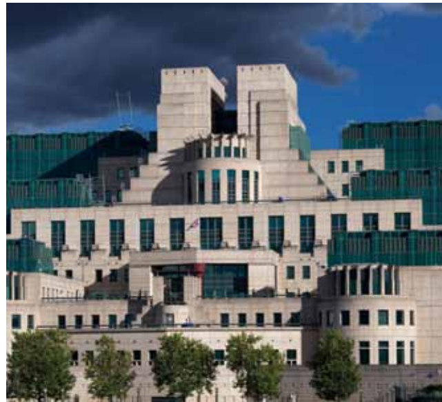
Building housing the MI6 headquarters in London.

The battle being fought right now in the United States between this “unholy alliance” and the intelligence apparatus from the Bush/Obama period, on the one side, and a patriotic grouping of whistleblowers and Trump voters on the other, is no internal American matter; it is of the highest strategic significance. If the neocons succeed, global war against Russia and China is pre-programmed.