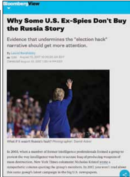
Examples of increased press and Internet coverage of the VIPS exposure of the fraud of the alleged Russian hack of the DNC server.

Russia (and Iran and North Korea). It is a new edition of the neocon project of 1997, the Project for a New American Century, under which the United States and Great Britain claim the right to impose a unipolar world—based on the Anglo-American special relationship. The wars of intervention against Iraq, Libya, and Syria—all based on lies—as well as various destabilizations and attempted color revolutions, were the result.