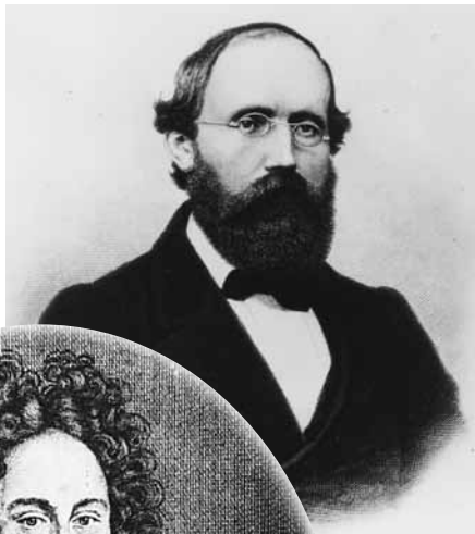
Georg Friedrich Bernhard Riemann (1826-1866)

Reprint of an article previously published in Fidelio magazine, Vol. V, No. 3, Fall, 1996.