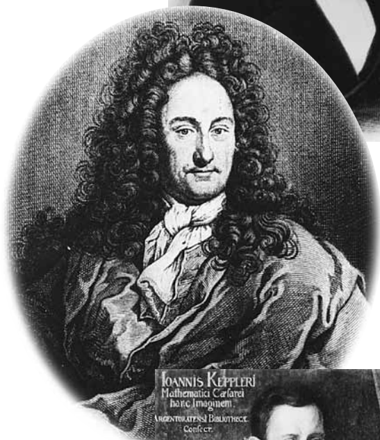
Johannes Kepler (1571-1630)