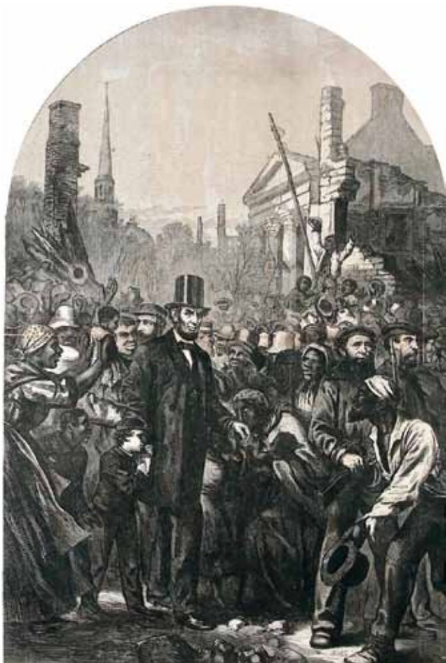
Lincoln entering Richmond, April 4, 1865.

now filled with ex-slaves, all joyously trying to get a glimpse of Lincoln.