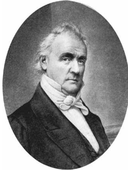
President James Buchanan

Yet even as he boarded the train, American intelligence agents were discovering a wide-ranging plot to assassinate him and take over the government. Since Lincoln's 1838 speech, an even more outrageous group of traitors had occupied the Presidential office, culminating in James Buchanan. Buchanan had been the American minister to the Court of St. James, and had fallen right in with the British plans for a slave empire by signing the Ostend Manifesto, which called for the occupation of Cuba and the extension of slavery. Once the slave-holding states saw that Lincoln had been