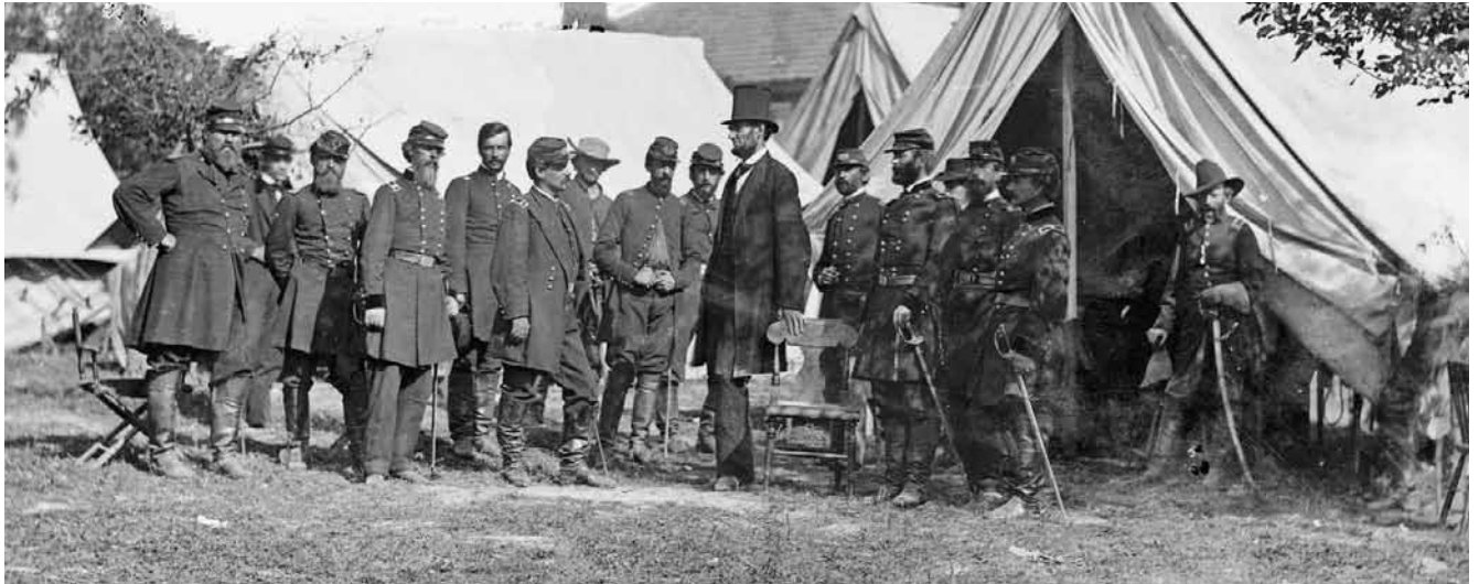
Lincoln with his Army at Antietam on Oct. 3, 1862 (Gen. George McClellan is facing off against him).

chosen. The water, indeed, was deep enough, and Lincoln jumped ashore and took a walk on enemy territory. Lincoln reported his findings, and General Wool's troops went ashore the next day only to find that the Confederates had gotten wind of Lincoln's maneuver and had abandoned the city! All they saw was the Mayor of Norfolk walking toward them holding out the keys to the city. Left without a base, the crew of the dreaded Merrimac blew her up and fled.