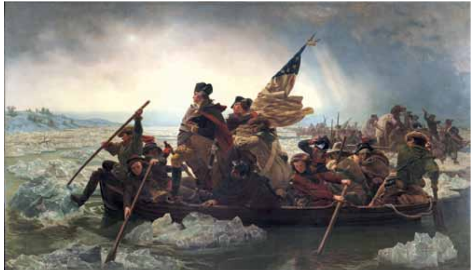
“Washington Crossing the Delaware,” by Emanuel Leutze.

Years later, on his way to his inauguration as President in 1861, Lincoln stopped to address the New Jersey Legislature at Trenton, a city which held special meaning for him. He told them that in “the earliest days of my being able to read, I got hold of a small book, such a one as few of the younger members have ever seen, Weem’s Life of Washington . I remember all the accounts there given of the battlefields and struggles for the liberties of the country, and none fixed themselves upon my imagination so deeply as the struggle here at Trenton, New Jersey. The crossing of the river; the contest with the Hessians; the great hardships endured at that time, all fixed themselves on my