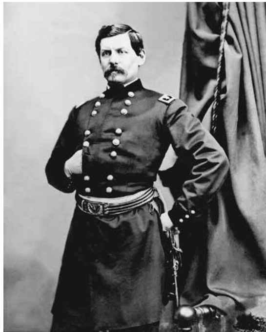
Gen. George B. McClellan