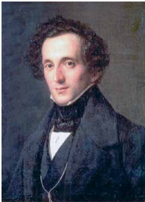
Felix Mendelssohn (1809-1847)