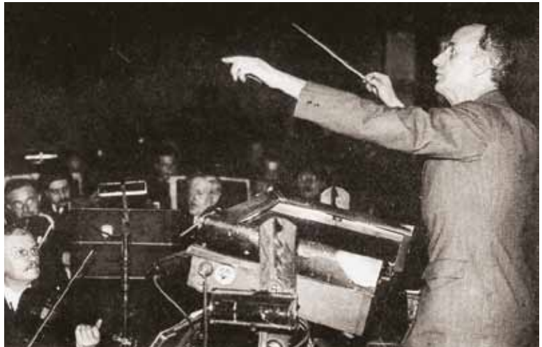
Société Wilhelm Furtwängler

The striking opening of Riemann's composition, clearing away a couple of millennia of lazy and wishful delusions, can be repeated in the experience of hearing Beethoven's Fifth, but without all the accumulated baggage; that is, hearing what the living Beethoven would have you discover about the powers of your own mind. This is not an esoteric subject for mathematicians and/or musicians. Indeed, a closely related experience is that of thinking through what the establishment of a nation as "a beacon of hope and temple of liberty" should have accomplished in the world, and how what has been determinable might now become determined. Indeed, the very ability to characterize the present moment in history, and to have that characterization be known to be on solid footing—more solid than the pretense of all the primitive, "Euclidean" methods of establishing supposed "solidity"—is a cultural and scientific gift from Beethoven and Riemann. The abil-