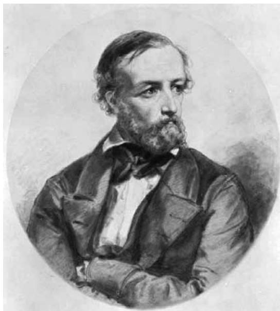
Lejeune Dirichlet (1805-1859)

Amongst other matters, Dirichlet guided Riemann to the works of Gauss and Abel, securing access for Riemann to Gauss's papers in the Berlin library, and bringing unpublished works of Abel to Riemann's attention. Riemann gave special credit to Dirichlet for spending many hours with him, especially during Dirichlet's 1852 visit to Göttingen. There they worked through what would become Riemann's famous 1854 "Habilitation" presentation, "On the Hypotheses Which Form the Basis of Geometry." There we meet with Riemann's bold overturning of the fixed boundaries of over two millennia of Euclidean assumptions, hidden behind Euclid's axioms: