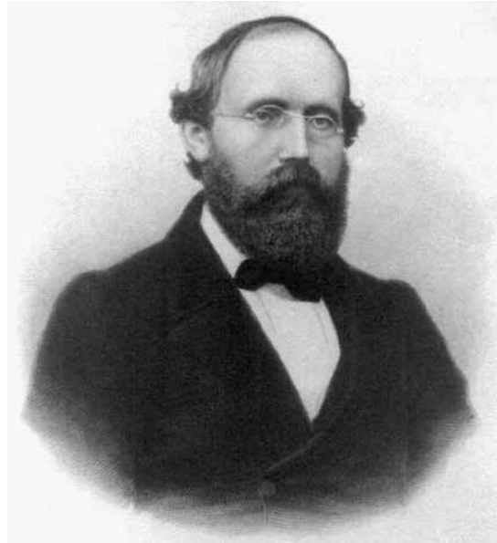
Bernhard Riemann (1826-1866)

What did Riemann's teacher know of Beethoven's Fifth? Mendelssohn conducted Beethoven's Fifth at Aachen on June 1, 1846. His close study of the score and careful preparation of the performance is evi-