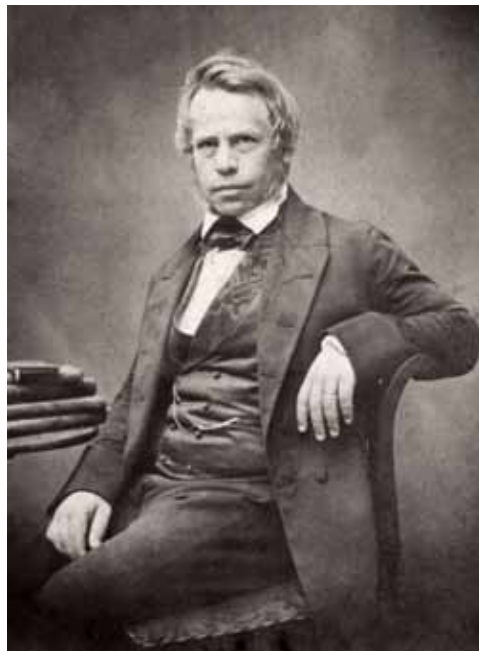
Jacob Henle (1809-1885)