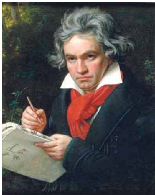
Ludwig van Beethoven (1770-1827)

After the American Revolution, a youthful genius, Karl Gauss, in what was apparently an obscure mathematical text, went boldly where most others feared to tread. An identifiable, small core of youth, took up Gauss’s challenge while he was alive. They were Sophie Germain, Lejeune Dirichlet, Niels Abel, Evariste