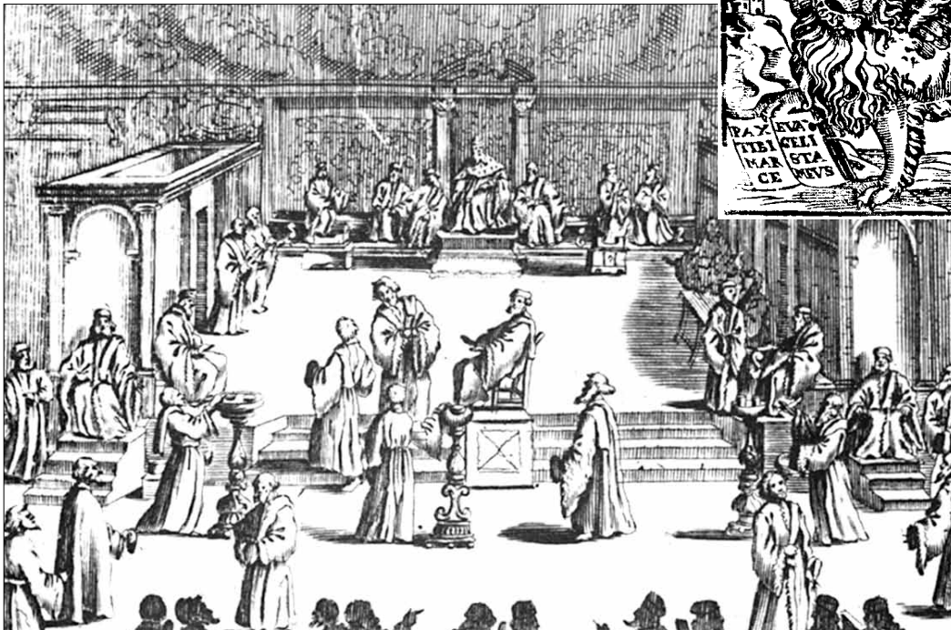
The Great Council of Venice: woodcut from a 1578 edition of Gasparo Contarini's Della Repubblica (inset: the Venetian Lion of St. Mark). The world's current crisis, LaRouche writes, presents us with the opportunity to free mankind of the succubus of the Venice-style financier oligarchy, which has preyed upon the economies of nations for 500 years.

One may hope that U.S. President “Bill” Clinton’s successful, Washington, D.C. meeting, with China’s President Jiang Zemin, signals an outbreak of much greater pungency and force, in confronting the United States’ London-steered political enemies, both within the U.S.A., and abroad, than we had seen from the “White House” quarter since Franklin Roosevelt and John Kennedy. If we are wishfully overestimating the Clinton White House, there is no cause for celebrating “our present way of life,” by the time Christmas—or, the November U.S. Congressional elections—comes due in 1998.