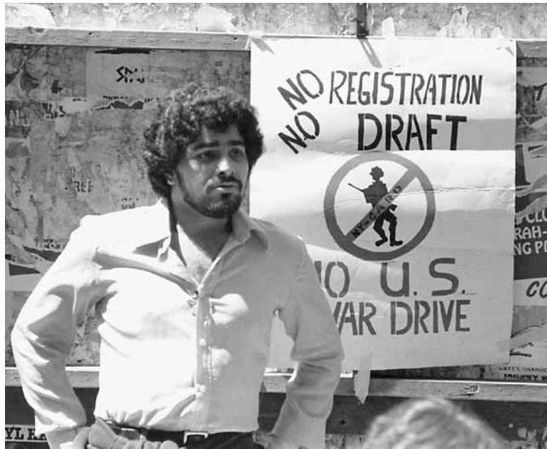
A demonstration in New York City in 1980. Victims of the counterculture’s “New Age” brainwashing, have now risen to the top positions in government and other institutions.

This long-term trend of net negative investment in the physical productivity of the U.S. economy, has provided the margin of negative accumulation of wealth, the which has been used to generate nominal financial profits of enterprises in the economy. The discounting of this marginal negative investment, has provided that flow of funds from the Federal Reserve System, which has been used, increasingly, to leverage financial capital gains in fictitious assets, rather than fostering real investment in production of wealth. Since 1971, speculation against “floating” national currencies, in “Petrodollar” loans, in “Junk Bonds,” and in the form of casino-gambling called “derivatives,” has vir-