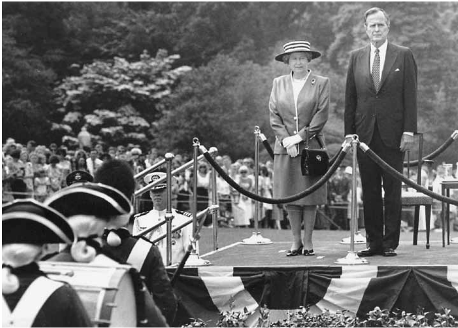
President George Bush with Britain's Queen Elizabeth II, in Washington, D.C. May 14, 1991. The British- Israelites have spread the fairy-tale, that the Queen is the lineal descendant of Israel's King David, and thus the rightful ruler of the world.

titute home with him, or, ever wish to be caught doing anything nasty, if that might do injury to the sensibilities of the community on which he relies for a good opinion of himself. If that theologian is caught in the act, doing something nasty, he feigns pitiable contriteness, but expresses this in that slyly threatening way, which says, "After all, are we not all wretches?"