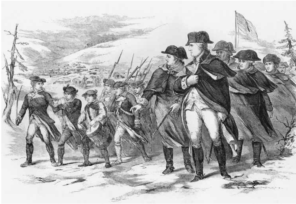
Gen. George Washington reviewing the troops at Valley Forge. The American colonists established the world's first true constitutional republic, intended to be free of that kind of symbiotic submission to financier-oligarchy which was characteristic of European nations.

Bank of Manhattan's Aaron Burr and treasonous August Belmont; and, the southern slaveocracy.