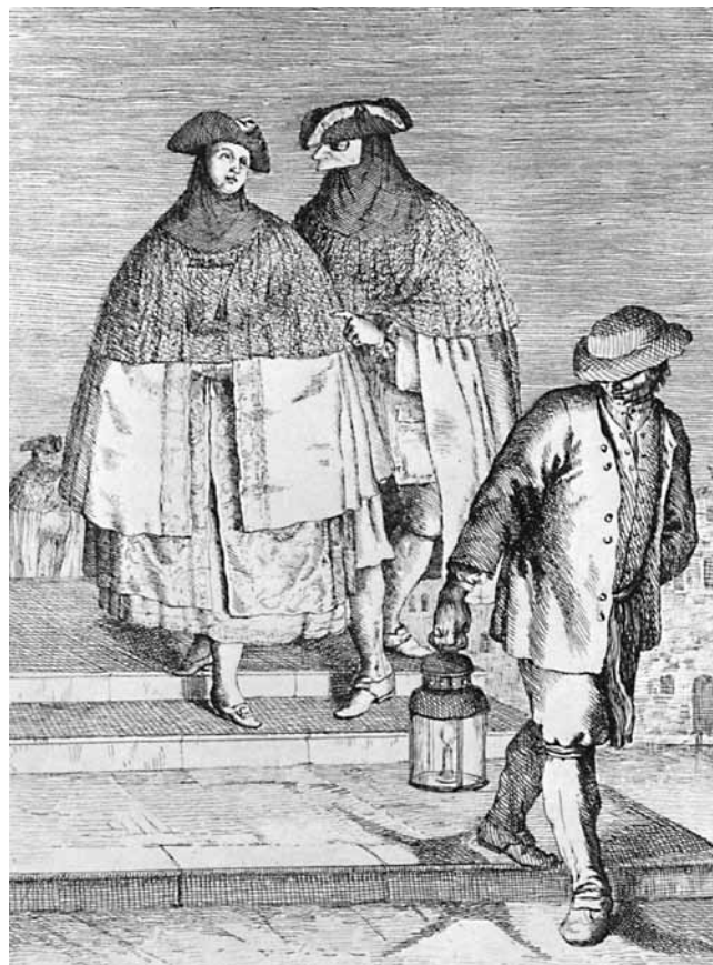
Venetian oligarchs go about their dirty dealings in the dead of night (a 1785 engraving). "Inevitably, the struggle for establishing the modern form of post-feudal society, made war against Venice's incarnate evil inevitable, and justifiable."

against Venice, by the France-led League of Cambrai. At the point Venice was about to be crushed, Venice exploited the cupidity of some members of the League, to split them from the League, and, even to become tools of Mephistophelian Venice against France.