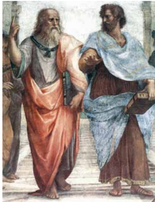
Raphael's "The School of Athens." Detail showing Plato (pointing up) and Aristotle.

In my knowledge of the matter, the idea of the immortality of the human soul, came meaningfully into the province of European physical science only as an aspect of what some currents of Judaism share with the scientific implications of Christianity. 19 My own knowledge of the history of that concept of immortality, is rooted in references to the work of Plato, and that of Cardinal Nicholas of Cusa and his followers, as that concept of the principle of human dynamics was illustrated as the argument famously illustrated in the Vatican Library's "School of Athens" by Raphael Sanzio. 20