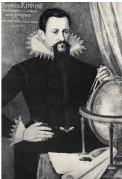
Johannes Kepler (1571-1630)

Johannes Kepler refuted Aristotle's geocentric cosmology, and charged that Aristotle held science back for nearly two millennia, until the advent of Copernicus, by rejecting the Pythagorean idea that the Earth moves in an orbit around the Sun. Here is an excerpt. Kepler's full document was published in 21st Century Science & Technology, Winter 2001-02.