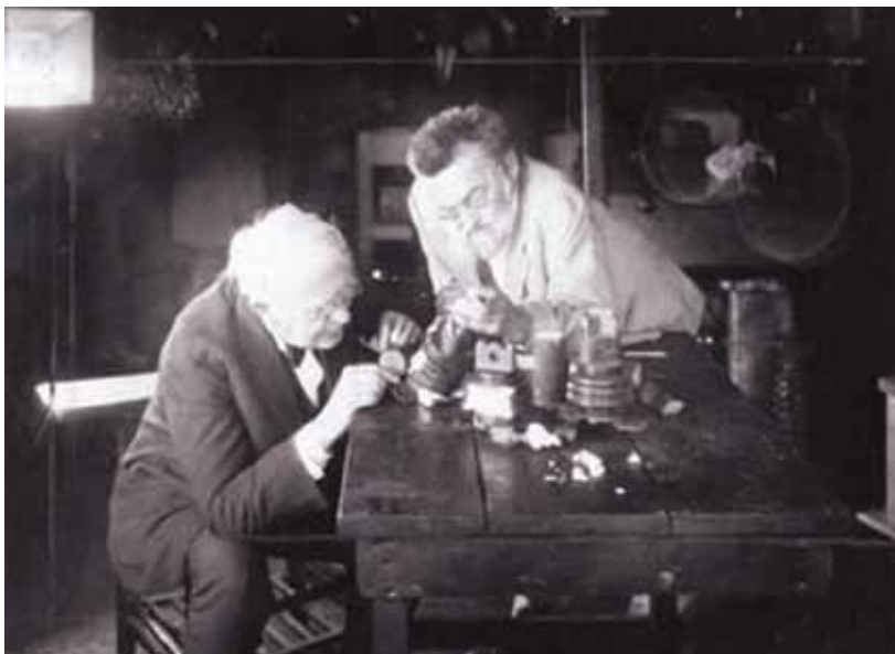
A crucial feature of productivity, ignored by British System economists, is individual human scientific and technological creativity. Here, scientist/engineers Thomas Edison and Charles Steinmetz, at a General Electric facility in Schenectady, N.Y., 1922.

That point is conveniently illustrated by referring to the related point that, contrary to the obscene suggestions of the so-called “globalizers,” virtually all good product tends to reflect a national cultural character of