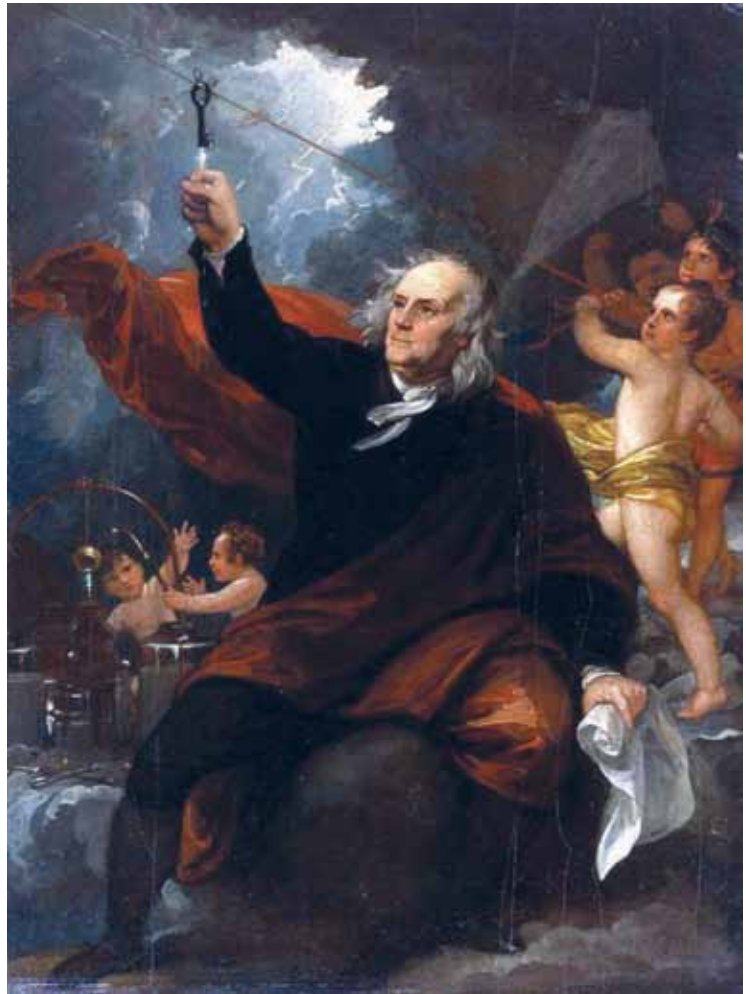
The dynamic quality of nations is fostered through scientific and technological achievements and their introduction into the physical economy, promoting the general welfare. This Leibnizian conception was well understood by Benjamin Franklin, whose scientific exploration of electricity is portrayed here by Benjamin West.

For example: Contrary to mechanistic presumptions, Johannes Kepler's uniquely original discovery of an efficient universal principle of Solar gravitation, in his The Harmonies of the World , remains, in fact, today, a prime example of what Gottfried Leibniz defined, during the 1690s, as a principle of physical dynamics. The categorical point of distinction of human society from animal ecologies, is a comparable case. The same harmonic quality of systems, is the subject of the physical science of such as Bernhard Riemann, V.I. Vernadsky, and Albert Einstein.