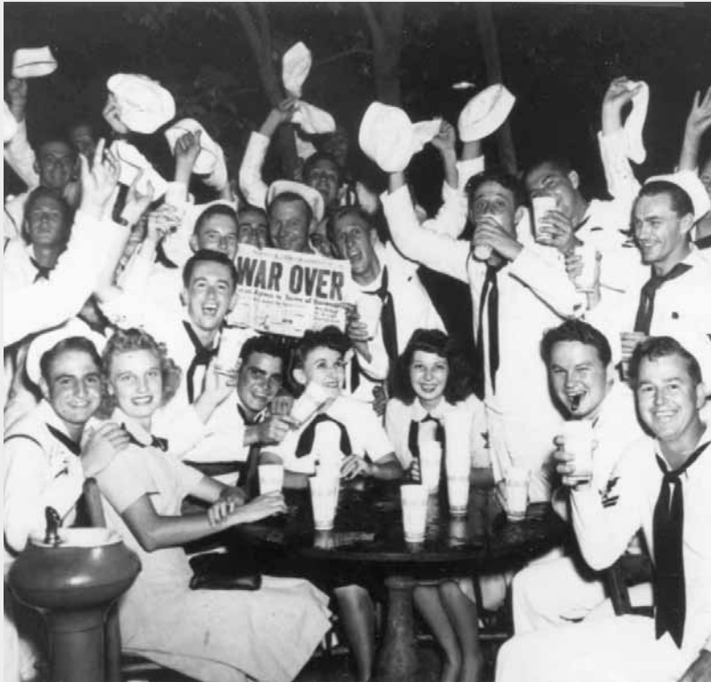
The end of the Second World War is celebrated in Norfolk, Virginia, 1945. Already, a shift was underway in the “spirit of the age.”