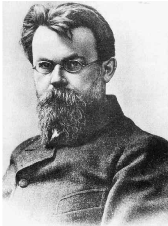
Academician Vladimir I. Vernadsky (1863-1945), the Ukrainian-Russian biogeochemist who pioneered the Soviet Union's nuclear program. His work, including his concept of the "Noösphere," is rooted in Riemannian physics.

On that account, I must, therefore, insert a qualification for what is to be said now. This qualification is, that all competent modern science is Riemannian in that coincidental sense of the use of the term "Riemannian" by both Einstein's treatment of the subject of Kepler's astronomy, and in the related case of Academician V.I. Vernadsky's defining of the physical chemistry of the Noösphere. The coincidence of intention expressed in these and related cases, hangs on that notion of dynamics which had been brought back to life, so to speak, by Gottfried Leibniz's defining the meaning of "dynamics" in connection with his attack on the incompetence of Descartes and, implicitly, also, Descartes' Seventeenth-Century and later empiricist