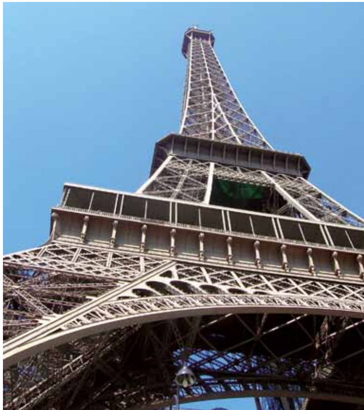
The magnificent construction of the Eiffel Tower illustrates LaRouche’s point that geometry is not a question of blackboard mathematics, but of structure in the physical universe.

In the rudimentary physics of design in construction, for example, we consider the specific relationship of the geometry of supporting structures, to the required mass of support required for the combined mass of both that support and that which it supports. The Paris Eiffel Tower is among the most conspicuous illustrations of this point, still for today. My own introduction to that physical view of geometry, came to me about the time I reached the age of fourteen, a consequence of my fascination with this ironical feature of the structures witnessed at the neighboring Boston area’s Charlestown