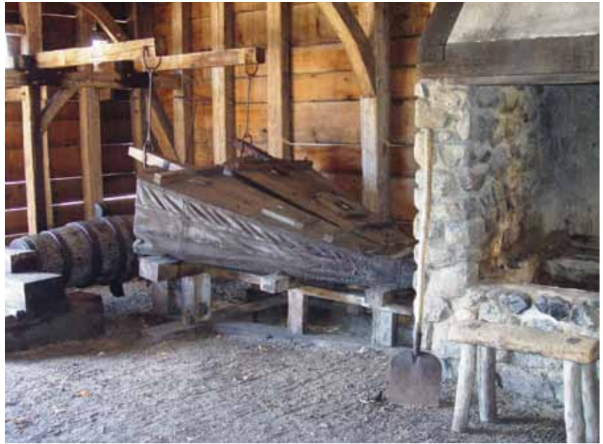
Reconstructed forge with bellows of the Saugus Iron Works, dating from the 1600s in the colonial era in Massachusetts.

America's founding fathers were quite aware that such a process of continual growth and advancement only happens in a society which fosters individual human creativity. The United States was born out of a