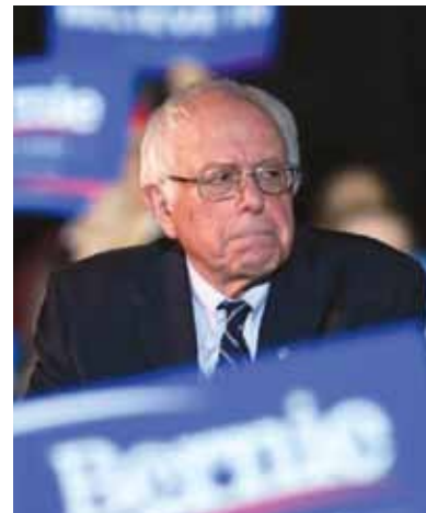
U.S. Senator Bernie Sanders.

kind does not actually create any really new economic potential without drawing down or destroying some other aspect of our productive potential (as the radical environmentalists tend to believe), or else the means by which governments are able to organize such trends in overall economic growth are not knowable to mankind in a hard and fast scientific way, as the free market libertarians believe.