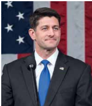
Speaker of the U.S. House of Representatives Paul Ryan.

Whether any individual objector is aware of his or her underlying beliefs or not, what shapes such thinking about economic policymaking is an implicit belief in the idea that mankind exists in a fixed relation to nature, a zero-growth state, a state of equilibrium. Either man-