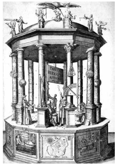
Johannes Kepler (1571-1630) gave modern science its first practicable, scientific conception of the astronomical universe. The illustrations here are from the LaRouche Youth Movement’s “Basement” project on Kepler’s Harmony of the World; the LYM explicates this monumental work through the use of animated graphics and musical examples ( science.larouchepac.com/kepler/harmony/ ). The drawing is from Kepler’s frontispiece to his 1627 Rudolphine Tables. It shows Copernicus and Tycho Brahe at the center, while Hipparchus and Ptolemy look on. On the base, the panel to the left shows Kepler himself, laboring by candlelight. The musical scales shown here are taken from Kepler’s Harmony, and show the “tonalities” of the harmonic orbits of the planets (these can be heard on the website). Above is the major scale; below is the minor scale.