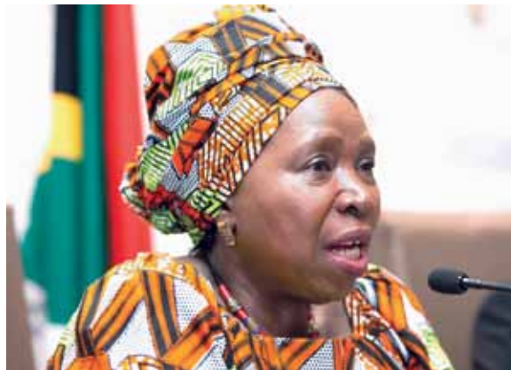
Nkosazana Dlamini-Zuma, Ramaphosa opponent.

For this reason, the same financial empire that sought a South African bloodbath in 1990—prevented only by Nelson Mandela—has ever since been taking steps to de-