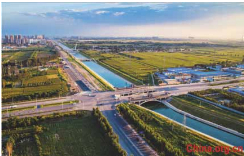
The landscape bridge in Xingtai, Hebei Province.