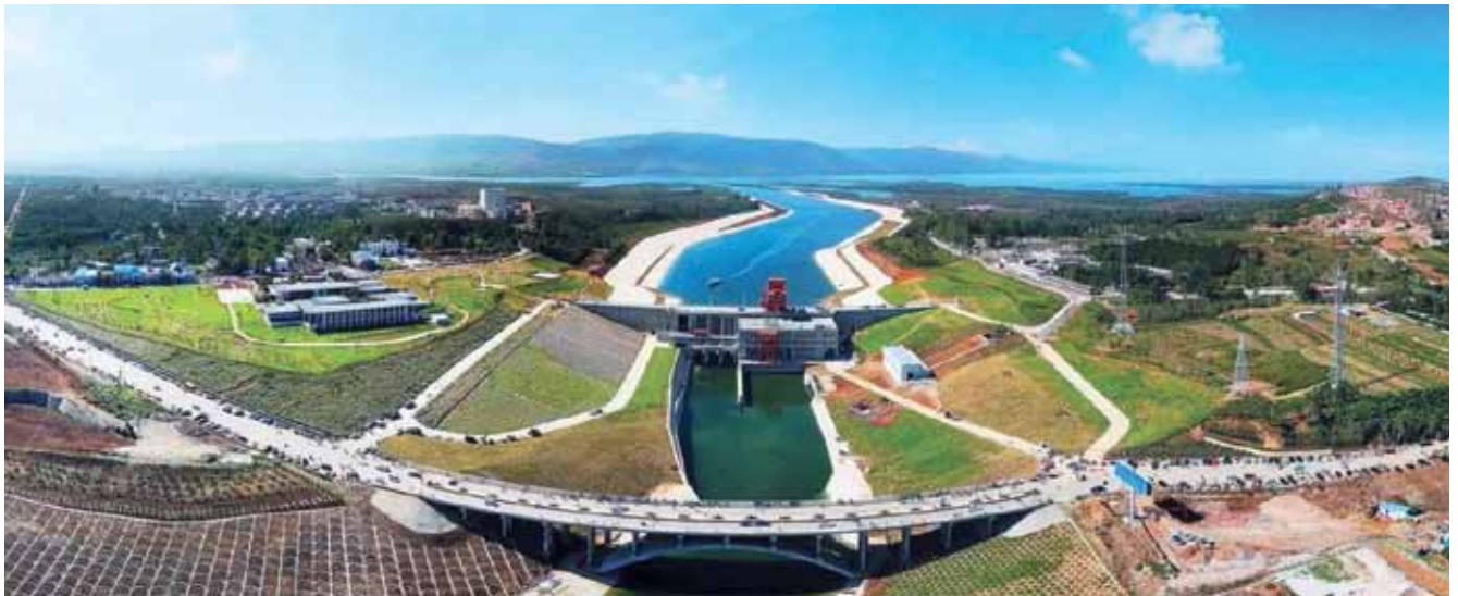
Central route starting-point Taocha in Xichuan County, Nanyang, Henan Province. Looking “upstream,” toward the Danjiangkou Reservoir.

There are three canal routes which, when completed, will together move 44 cubic km/yr of water to the North. For comparison, the Yangtze discharges on