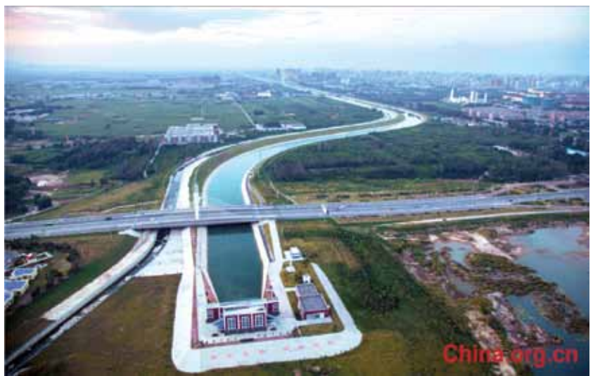
The exit of the Qilihe Canal Inverted Siphon Project.