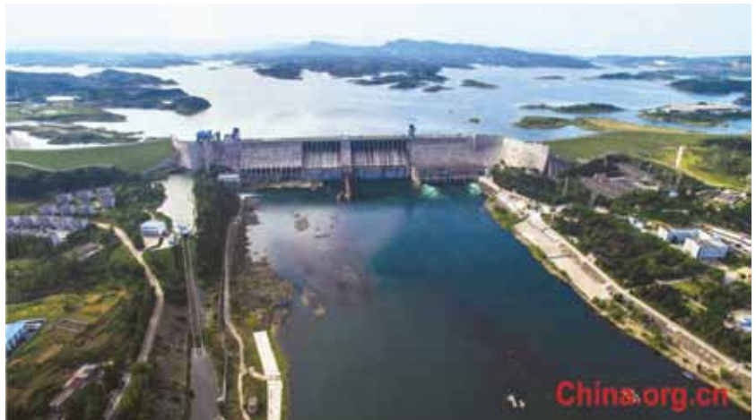
The Danjiangkou Dam in Hubei Province.

The Qinghai-Tibetan Plateau is known as Sanjiangyuan , i.e. "The Source of Three Rivers" (the Yangtze, the Yellow, and the Mekong). Also originating in southwestern China are the Brahmaputra and the Salween. Plans have been sketched out to transfer water to the North from the headwaters of the