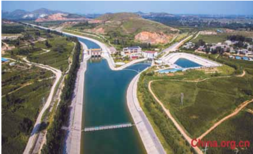
The Xiheishan flow division gate.