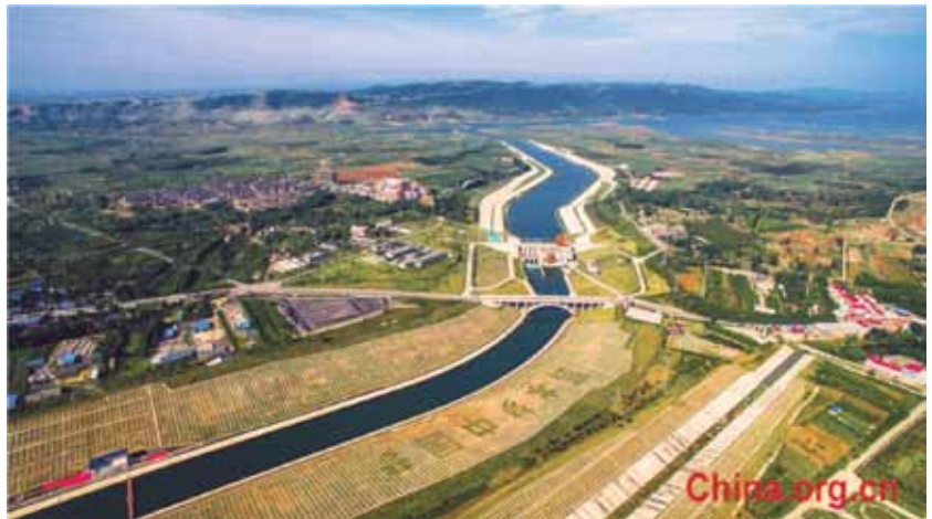
The head of the middle route of the South-North Water Diversion Project.