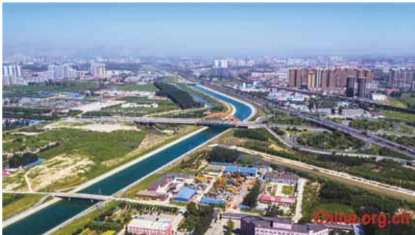
The Longquan Bridge in Shijiazhuang, capital city of Hebei Province.