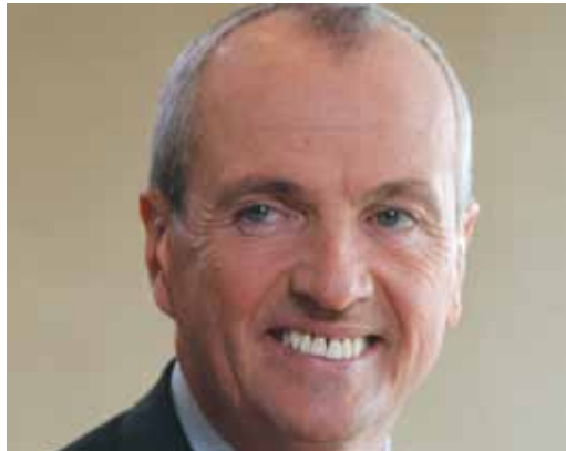
New Jersey Governor Phil Murphy, formerly of Goldman Sachs.

Currently, due to massive investments in natural gas, New Jersey gets “only” 39% of its electricity from nuclear power, and about 56% from natural gas. Nuclear power was over 50% before 2012. The local power company PSE&G has been championing legislation to allow a very small rate increase to subsidize the nuclear plants in order to keep them operating. This was scheduled to come up for a vote last year, but Governor Murphy put it off, and is not pushing for it now. Exelon, the owner/operator of the plants, has warned that if the subsidy is not approved, it will cease to maintain the plants, causing them to close. Obviously, this would be a sub-