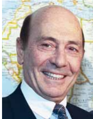
Manfred Wörner, Secretary General of NATO.