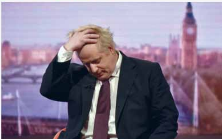
UK Foreign Secretary Boris Johnson.

First of all, it is noteworthy that the two Skripals fortunately seem to be in much better condition. That raises a whole bunch of questions because if it was Novichok nerve gas, then the question is: How did the British so quickly provide an antidote such that the two victims are now happily surviving? Or, maybe it was not Novichok. How could they so quickly come to the conclusion that it was Russia, when Scotland Yard said it would take several weeks to find out what really was the nerve gas agent used in this attack?