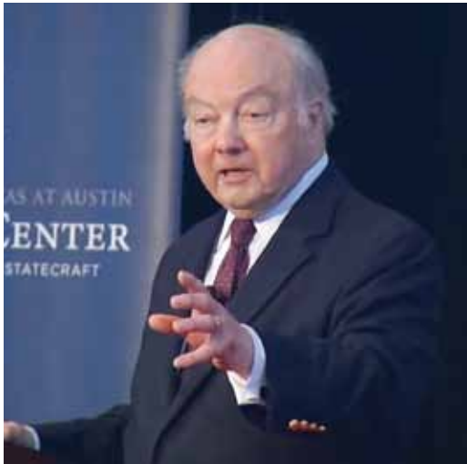
Jack Matlock, Jr.