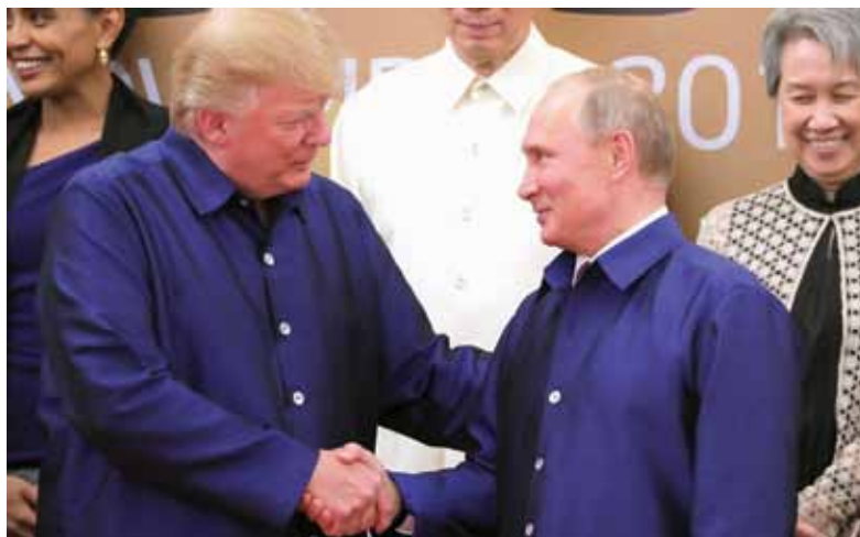
President Trump (left) greeting President Putin at the APEC Summit, November 2017.

All of this comes at a moment at which, at any moment, we could have a new financial crash much