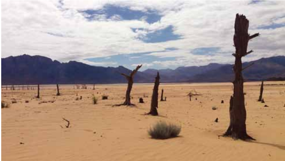
A portion of Theewaterskloof reservoir, the largest serving Cape Town, was at 11% of capacity at the time of this photo in March 2018, showing tree stumps and sand usually submerged.