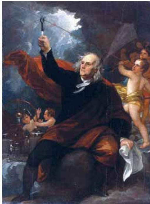
painting by Benjamin West 'Benjamin Franklin Drawing Electricity from the Sky.'

Take the case also of the American Revolution. It was the scientist Benjamin Franklin who was the true author of the American Republic, an intention which he made clear as early as 1733, when in