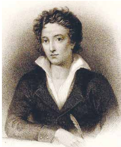
Percy B. Shelley

But even whilst they deny and abjure, they are yet compelled to serve, the power which is seated on the throne of their own soul. It is impossible to read the compositions of the most celebrated writers of the present day without being startled with the electric life which burns within their words. They measure the circumference and sound the depths of human nature with a comprehensive and all-penetrating spirit, and they are themselves perhaps the most sincerely astonished at its manifestations; for it is less their spirit than the spirit of the age.