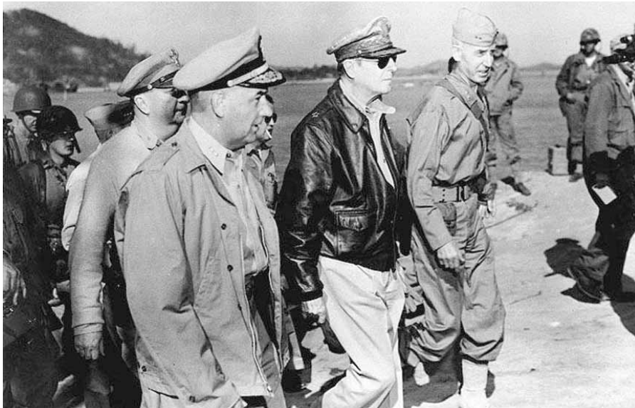
General Douglas MacArthur (center) at Inchon, Korea, 1950.

In the 1980s and 1990s LaRouche’s writings were studied intensively throughout the world, including among some of the highest leadership circles in Russia, China, and India. The effects of that intervention are witnessed today, including in the China-led Belt and Road Initiative. LaRouche never pandered.