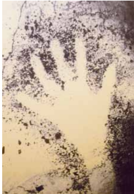
Stencil of a human hand from Cosquer cave, near Marseille, France, dating from 27,000 Before Present Era.

In Book 20 of the Odyssey , Homer also depicts a solar eclipse. What is most remarkable about this is that Homer also describes the precise position of Venus (high in the sky), the visibility of the Pleiades, and the retrograde motion of Mercury (Hermes) low in the evening sky. Recent astronomical research has shown that the occurrence of a solar eclipse with the precise conjunction of these three other astronomical events actually occurred about 1188 BC, almost 300 years before Homer was born, and approximately at the time of the downfall of Troy.