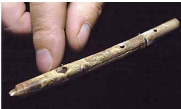
A 35,000 year old flute, an early example of metal working.

Much of this progress, including the usage of copper, iron and bronze, as well as the beginnings of animal domestication, was centered in a region which stretches from the Caspian Sea, through the Caucasus, 3 along the shore of the Black Sea, into northern Anatolia, and then ending in the Balkans. The use of copper in tool-making dates back to at latest 9,000 BC, probably earlier, and the earliest verifiable high-temperature “copper-works” are from an archaeological site in present-day Serbia. The earliest large-scale smelting of iron took place in Eastern Anatolia, and the earliest known surviving iron artifacts were discovered in northern Iran. Glass was also invented in the same region.