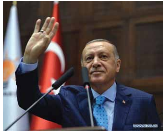
Recep Tayyip Erdogan, President of Turkey.