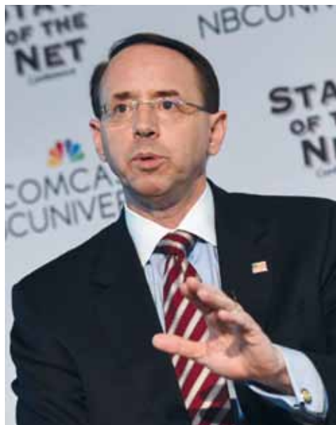
CC/International Education Foundation Rod Rosenstein, Deputy Attorney General.

You mentioned the mid-term elections. What can, and should, be done? There are big problems in the Republican Party, including foreign policy toward Russia and China. Maybe we should go to that. What do you make of all these sanctions? This is part of the same battle, isn’t it?