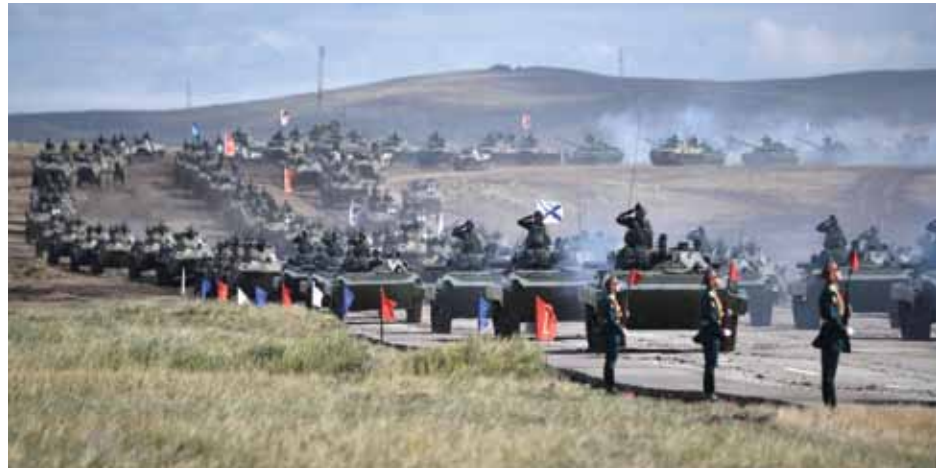
Vostok-2018 military maneuvers on the Tsugol training range, Trans-Baikal Territory, Russia, Sept. 13, 2018.

It is also very clear that right now we are in a count-down, where there is not one iota of doubt that the faction of the British Empire that includes the British government, the Democrats, and the neo-cons in the Republican Party, are trying everything to prevent Trump from fulfilling his campaign promises. Especially after the historic summit in Helsinki, where Trump and Putin met—about which Trump even recently said that this was one of the best meetings he has ever had—all hell broke loose. It is absolutely clear that this faction does not want Trump to move on this