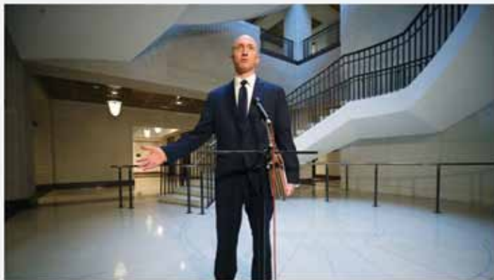
Carter Page, former foreign policy adviser for the Trump campaign, speaks to the media after testifying before the House Intelligence committee on Nov. 2, 2017.

the French Revolution, après moi, le déluge . We're back in the days in which entertainment and pornography replace scientific thought and poetry; in which drugs and rage replace bold ideas and the serenity necessary for truly creative thought.