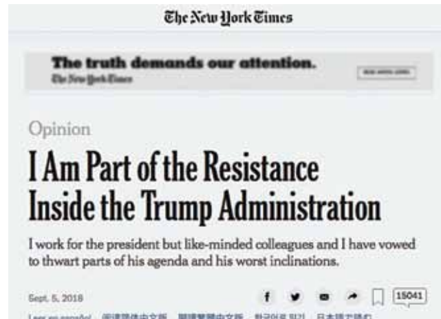
“Resist” op-ed in the New York Times.

shooting from the hip and firing Rosenstein. Rosenstein should have been disqualified a long, long time ago from any partici-