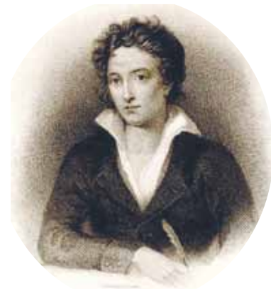
Percy Bysshe Shelley