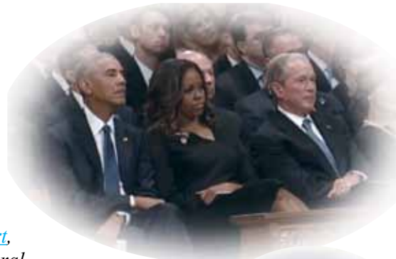
Radio Free Europe/ Radio Liberty

Let's just take, for example, the coup events of the past month. Let's think about them not from the standpoint of a consumer of news, or you just sitting there being hit with this stuff. Rather, just for a second, put yourself in the shoes of the enemy propagandist, who is intent on overturning the results of the 2016 election,