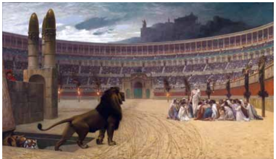
Painting by Jean-Léon Gérôme

color revolution, a cold coup against the President, and, I will argue here, against reason and truth and this nation itself. Many of us, for the past few days, found ourselves, as in Augustine's account of Alypius and the Roman killing games, glued to a televised spectacle in