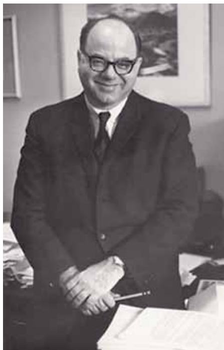
Congress for Cultural Freedom sociologist Daniel Bell.

As Lyndon LaRouche emphasized in founding documents of his organization, these "new left" ideas were drawn from the syndicalism of Benito Mussolini's fascist state and the national bolshevism of Gregor Strasser, ideas identical with what FDR's intelligence services labeled, "Synarchism/Nazi-Communist." Their "community control" social structures were derived directly from the Tavistock Institute's Kurt Lewin and his studies of the dynamics of small groups. Their smallness precludes attempts to exert major influence on