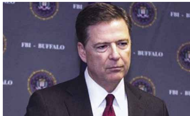
Former FBI Director James Comey.