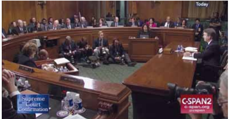
Supreme Court Nominee Judge Brett Kavanaugh testifying at his Senate Judiciary Committee hearing, at which Democrats focussed on alleged sexual assault, Washington, D.C., Sept. 27, 2018.

'Though you drag my body to that place and set me down there, you cannot force me to give my mind or lend my eyes to these shows. Thus I will be absent while present, and so overcome both you and them.' . . . But when one of the combatants fell in the fight, a mighty cry from the whole audience stirred him so strongly that, overcome by curiosity and still prepared (as he thought) to despise and rise superior to it no matter what it was, he opened his eyes and was struck with a deeper wound in his soul than the victim whom he desired to see had been in his body. . . . For, as soon as he saw the blood, he drank it in with it a savage temper, and he did not turn away, but fixed his eyes on the bloody pastime, unwittingly drinking in the madness—delighted with the wicked contest and drunk with blood lust. He was now no longer the same man who came in, but was one of the mob he came into, a true companion of those who had brought him thither.