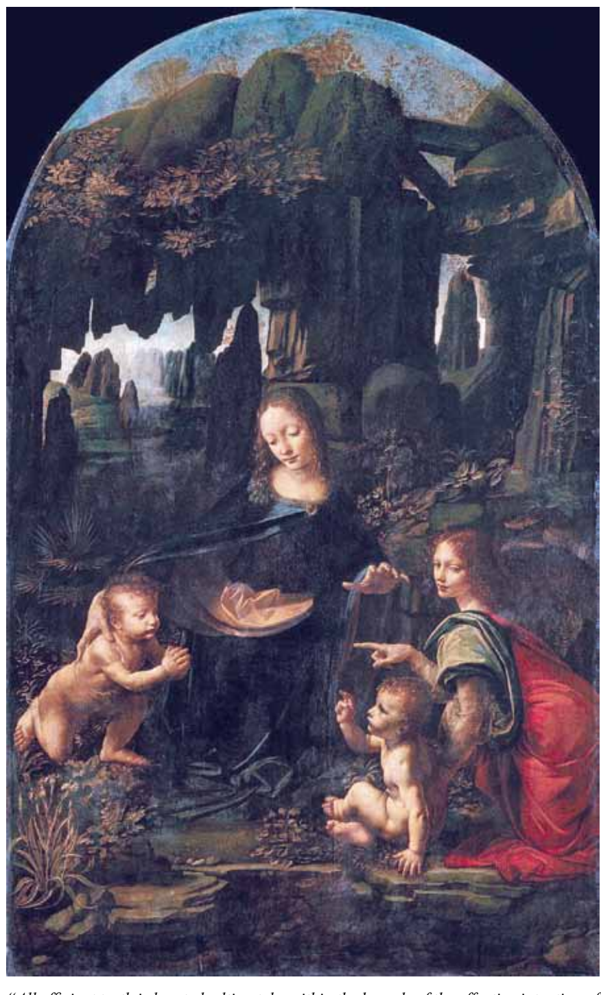
"All efficient truth is located, ultimately, within the bounds of the effective intention of what is to be defined as metaphor," LaRouche writes. Leonardo's use of "sfumato" (seen as if through smoke) and "chiaroscuro" (light/dark), to convey ambiguity, i.e., metaphor in painting, are evident in his "Virgin of the Rocks" (Louvre, ca. 1480)

other leading achievements, Cusa was the founder of a systemic comprehension of that then newly-stated principle of physical science, an authority which is defined