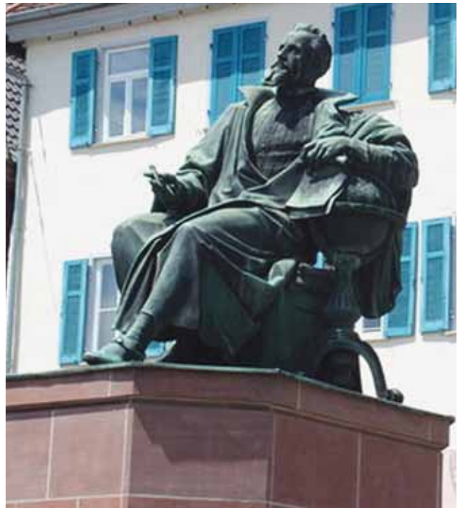
Johannes Kepler, statue in Weil der Stadt, Germany. His work created the foundation of all competent modern science “in opposition to all reductionist novelties uttered since that time,” LaRouche writes.

has also been characteristic of the governing principle among leaders within the present European Union, and, therefore, also the mood-swings in existential outlook of the populations generally.