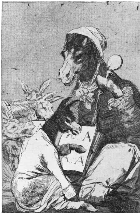
Si sabriè mas el discipulo?

So, for now, "we see as through a glass, darkly; but then, face to face; now I know in part; but, then I shall know even as I am known."