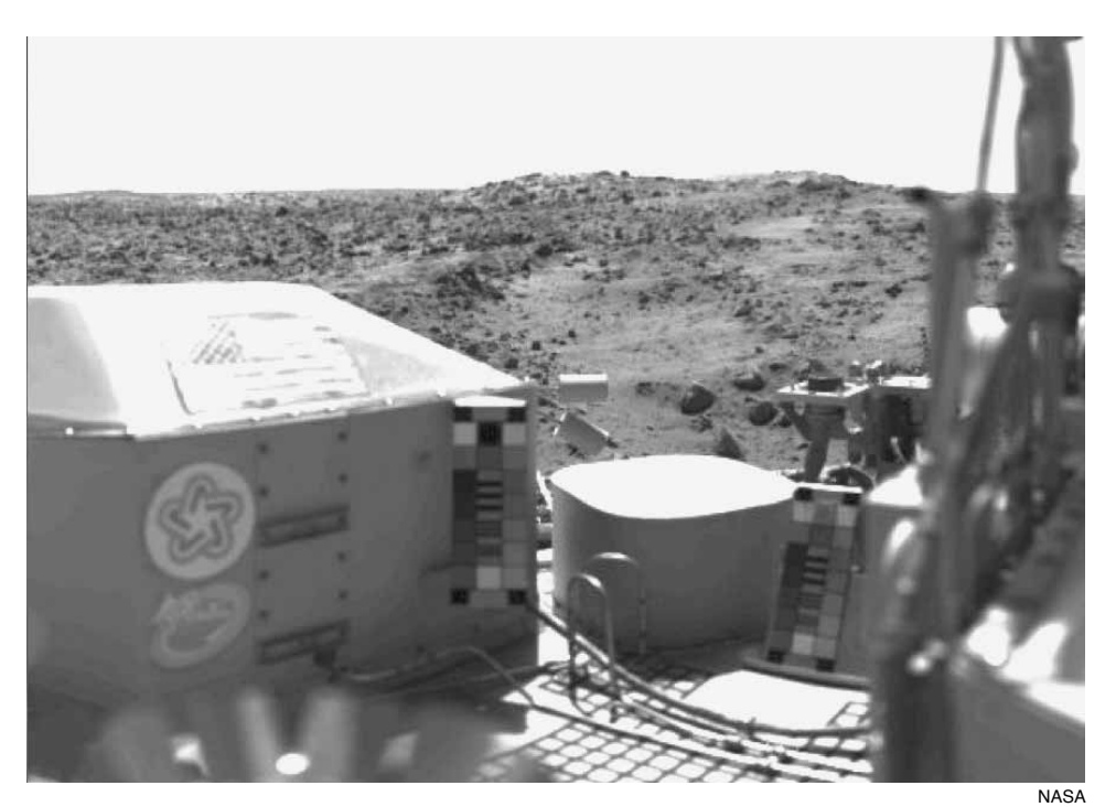
Humanity's next "mission-assignment": the colonization of the Moon and Mars. With the technologies developed for Mars, the cultivation of the Sahara and Gobi deserts on Earth become relatively child's play. Shown here is NASA's Viking 1, on Mars in 1976.

plishment of the mission-assignment, or will occur as a by-product of that mission-assignment. Once all the technology needed for a permanent colonization of Mars is completed, perhaps twenty years ahead, we shall then shift the mission-assignment, to a next, more ambitious task to go into construction during the middle of the next century, such as, perhaps, the "earth-forming" of Saturn's largest moon Titan.