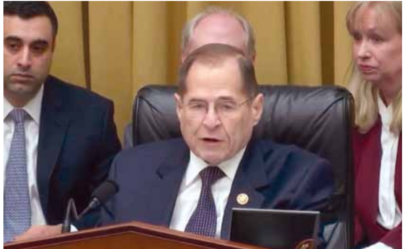
Rep. Adam Schiff