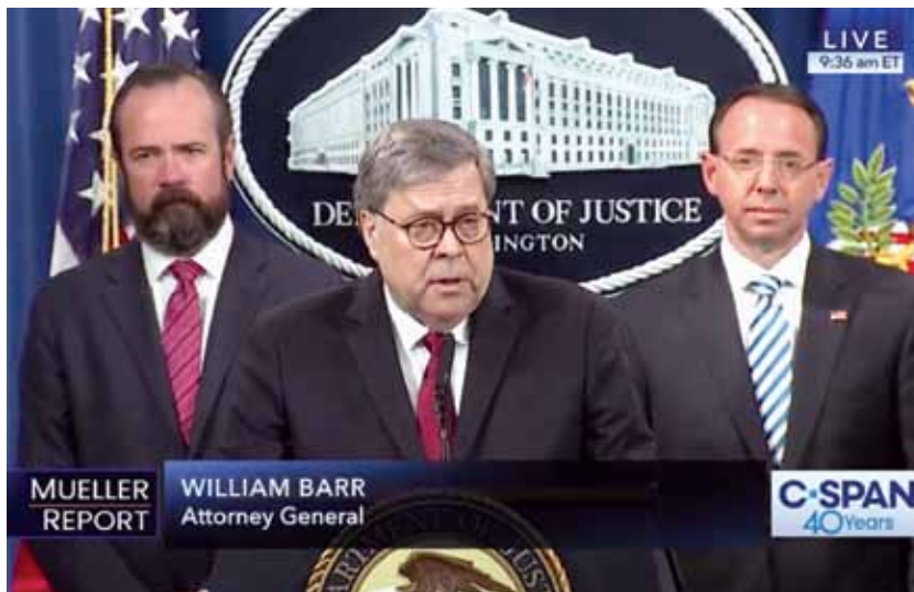
Attorney General William Barr news conference on the Mueller Report release on April 18, 2019.

As Attorney General Barr has pointed out, including in his testimony on Capitol Hill, investigating an American presidential candidate is "a very big deal"