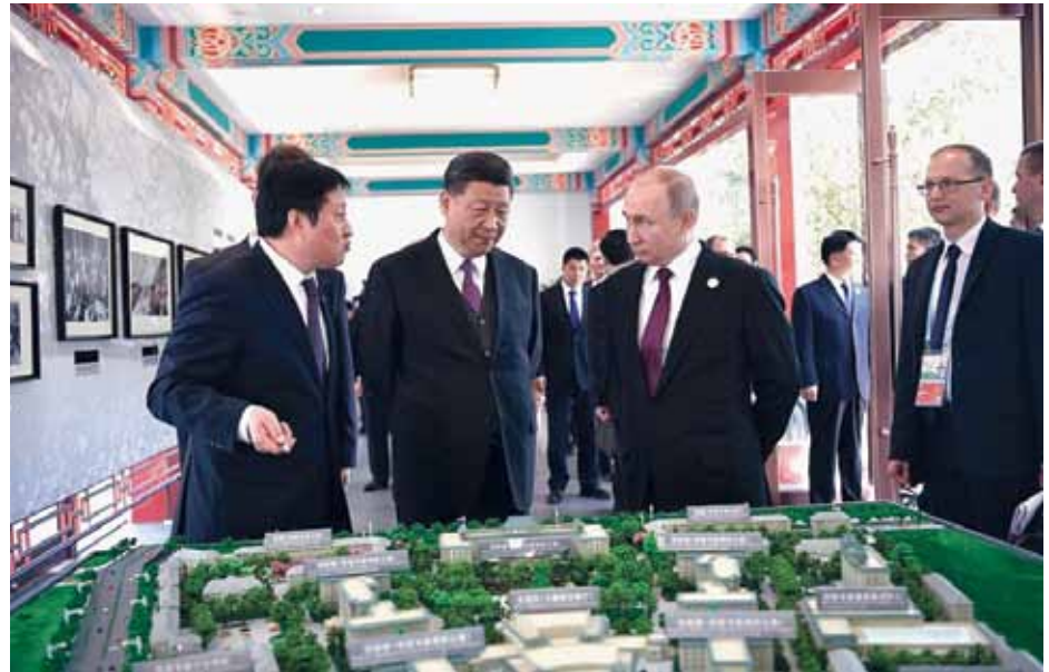
Xi Jinping and Vladimir Putin visit an exhibit on the history of the Beijing Friendship Hotel.

Altmaier, the German Economics Minister, couldn't help himself—he gave a speech emphasizing the usual kind of litany, transparency, rules, and so forth, completely oblivious to the New Silk Road spirit that was clearly present for most of the other participants. He completely failed to take note of the fact that President Xi Jinping had announced major, major measures for a