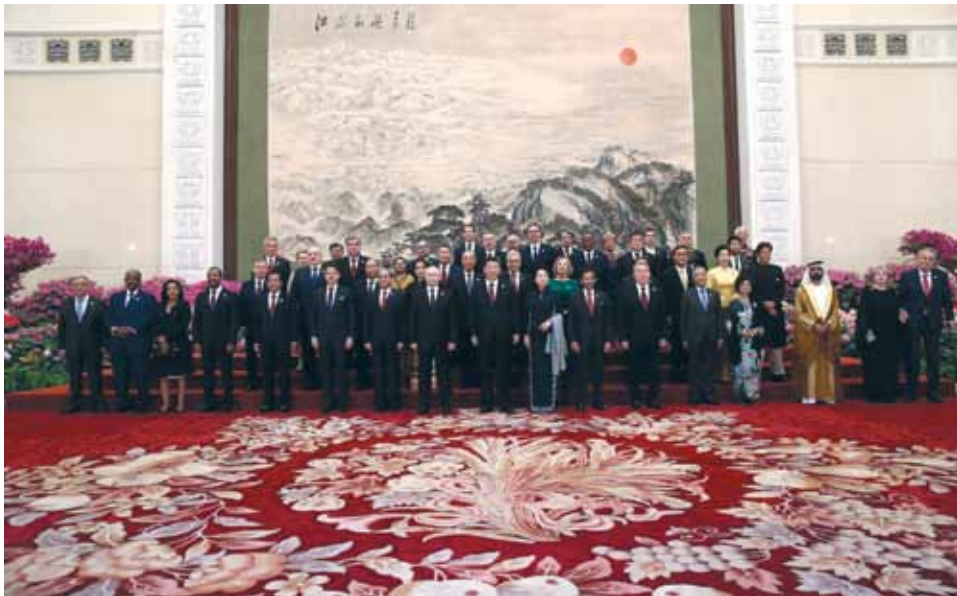
Participants gather for a group photo before the gala reception.

a book about it. And then, in Africa, naturally, people have living memories of British colonialism.