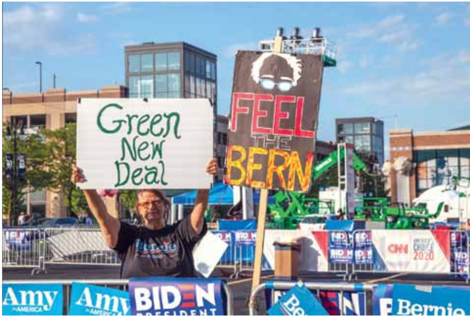
Democratic Party presidential hopefuls all endorse the Green New Deal. A campaign rally in Detroit, Michigan on August 1, 2009.

some $1.65 trillion to build the massive solar and wind farms themselves, gobbling up hundreds of times more space than nuclear plants producing—reliably and constantly—the same electrical power.