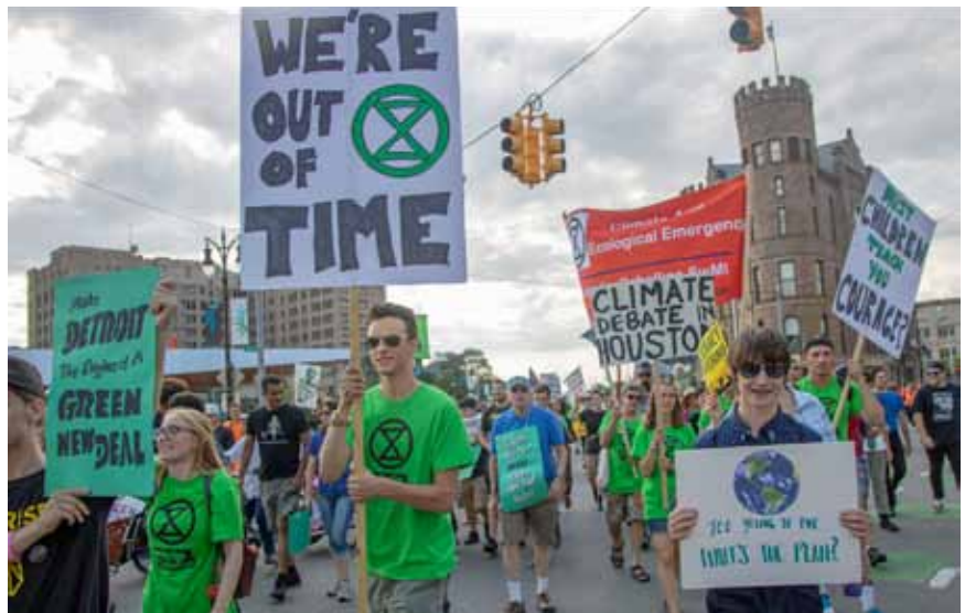
Green New Deal rally in Detroit, July 2019.

But this does not make solar a baseload power source. The users rely on a local or regional grid that is powered by baseline power sources, most often coal- or gas-powered plants. The energy efficiency is low; the power density is, comparatively, even lower. Nor does this exchange price between “rooftop solar” and the grid express the actual costs of solar power; solar power is still dependent on a publicly-financed power grid. Anyone talking about “going off the grid” is speaking