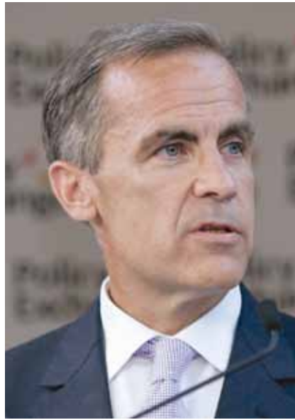
Philipp Hildebrand, former Swiss National Bank chairman.