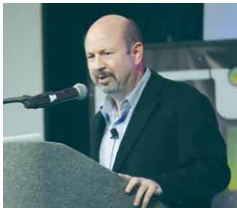
Dr. Michael Mann, inventor of the phony “hockey stick” global temperature graph.

Moreover, during the well-documented Medieval Warm Period (MWP) from about 950 to 1350 A.D., warmer global temperatures allowed Viking farmers to raise crops and tend cattle in Greenland. The equally well documented 500-year Little Ice Age (LIA) starved and froze the Vikings out of Greenland, before reaching its coldest point, the Maunder Minimum, 1645-1715. That’s