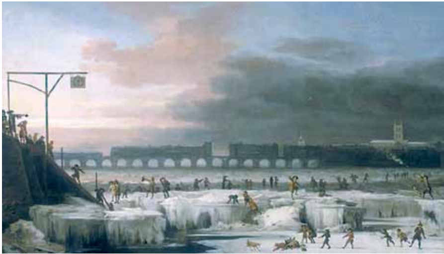
The Frozen Thames, a painting by Abraham Hondius, 1677.