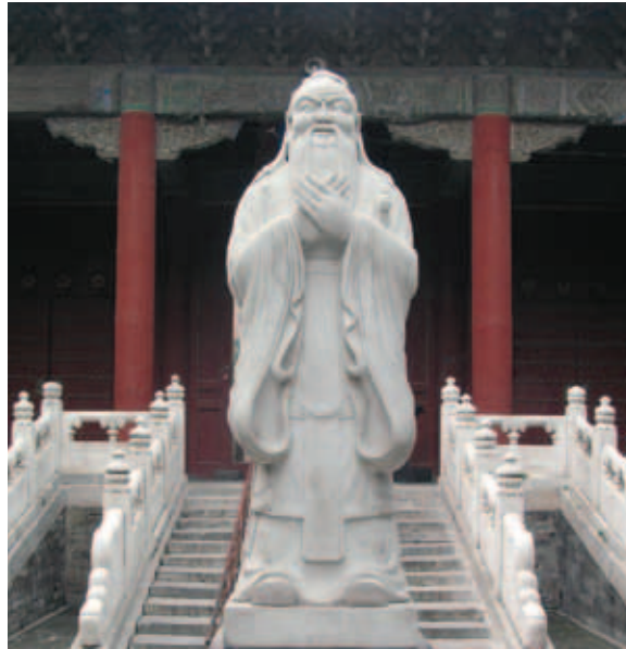
Statue of Confucius at the Confucius Temple in Beijing, China.

This is one of its unique characteristics which make it another