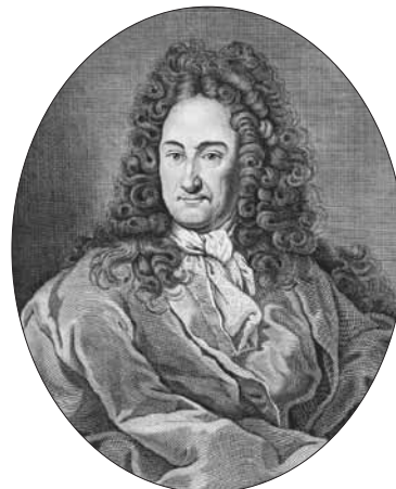
Novissima Sinica (News from China), written in 1699 by Gottfried Wilhelm Leibniz: "The most civilized, most distant peoples, are reaching out their arms; and to thus lead all lands found between them to a way of life filled by reason."