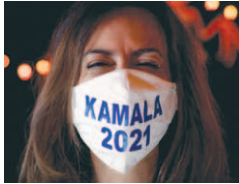
A 52-second video, posted on Hallowe'en, advises voters not to be fooled by Democrat Presidential candidate Joe Biden and his running mate Kamala Harris: "Who's behind the mask? Know who you're voting for. Don't get tricked!"

it, "Don't Get Tricked." The plot has Kamala, wearing a Joe Biden mask, stealing all the treats from children on Halloween. See "Don't Get Tricked."