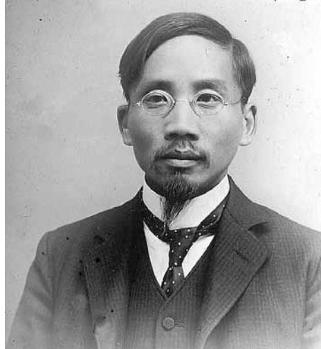
Cai Yuanpei, the scholar who is key for understanding the exquisite affinity of Confucius and Schiller.