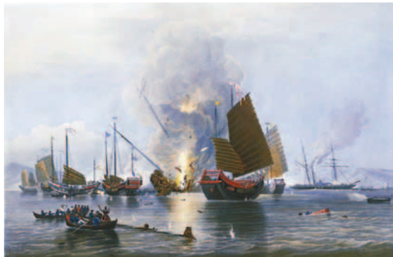
Edward Duncan, 1843

Another exception: the Great Britain of George III, which found itself with a sizeable trade deficit with China and, in 1840, launched two Opium Wars along with its allies, to forcibly impose the "free trade" of drug trafficking. And so the West invaded, occupied and colonized the richest third of Chinese territory for a century, which the Chinese refer to as "the century of humiliation." The West thereby became the aggressive enemy of China.