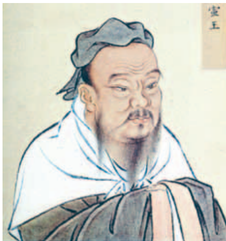
"An extraordinary similarity [exists] between especially Confucius and Friedrich Schiller, in respect to the method of moral improvement of man: the aesthetic education."

Leibniz's enthusiastic response to the reports he received from the Jesuits in China about Confucius were nourished for a similar reason: He regarded his approach of life-long learning and self-perfection as the way out of