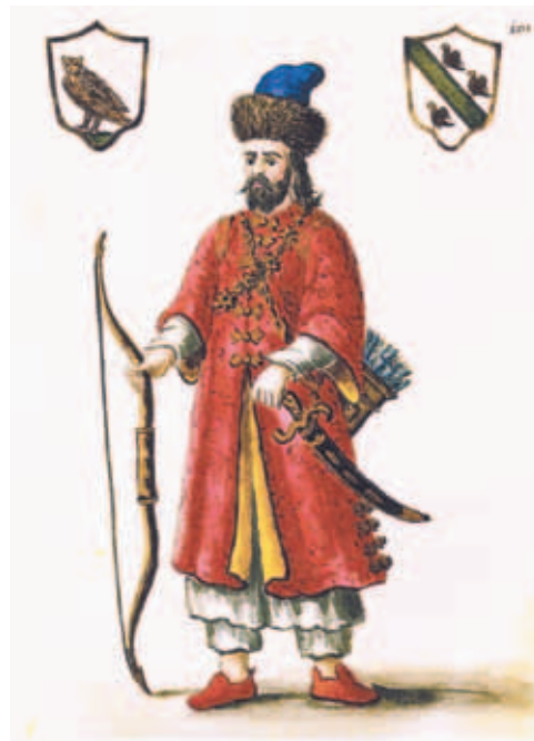
Marco Polo is depicted in Tartar costume in this print from the 18th century.

Therefore, we can assert that Chinese civilization and Western