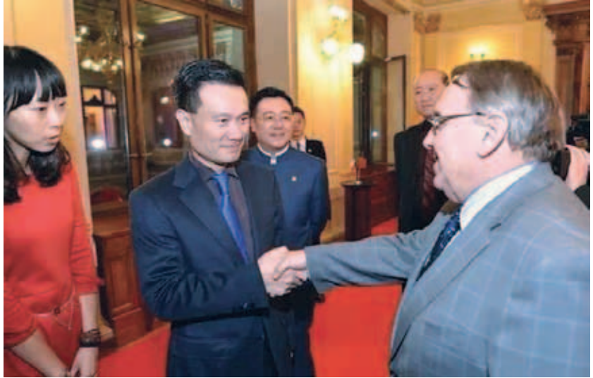
Hunter Biden's corruption extended into China. He took influence money from Patrick Ho (left), lobbyist for CEFC China Energy, later arrested over bribes to officials of African countries. Hunter began to represent Ye Jianming (right), Chairman of CEFC China Energy, until Ye was arrested for bribery and his company dismantled by the Chinese government.

demonstrates this. See “Johnson, Grassley Release Report on Conflicts-of-Interest Investigation.” Following the explosive Carlson interview, Bobulinski was interviewed at length by the FBI.