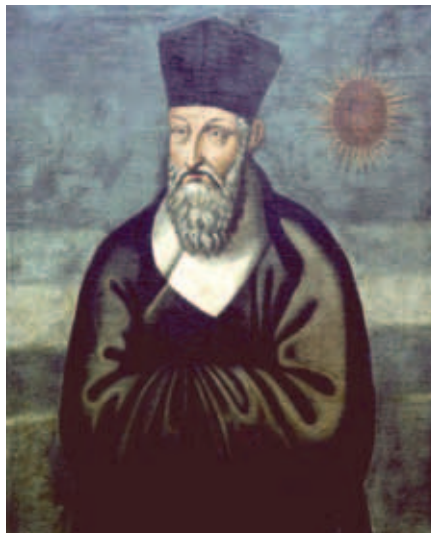
A 1610 Chinese portrait of Matteo Ricci, the founder of one of the Jesuit missions to China.

In 1421, the inauguration of Beijing as the new capital of the Empire was attended over a period of two years by visitors from more than 300 countries or terri-