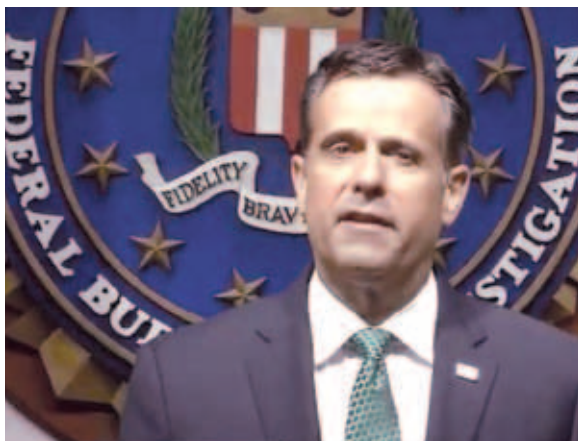
Michael Pompeo, Secretary of State.