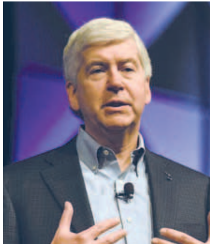
Rick Snyder, former Governor of Michigan.

declaring that China “intends to dominate the U.S. and the rest of the planet economically, militarily, and technologically.” China, he said, “poses the greatest threat to America today, and the greatest threat to democracy and freedom world-wide since World War II.” A psychotic notion, aimed clearly at preventing China’s rise, to prevent the Belt and Road Initiative from bringing real development to the developing world based on the economic model which has transformed China into a leading scientific and cultural nation, the first nation to eliminate abject poverty entirely, and one which is experiencing a Confucian Renaissance of world-historic significance.