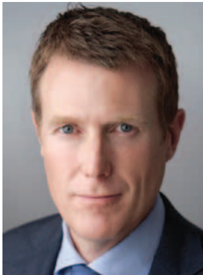
Commonwealth of Australia

China Matters does not have an institutional view. It is for this reason that heads of Federal Govern-