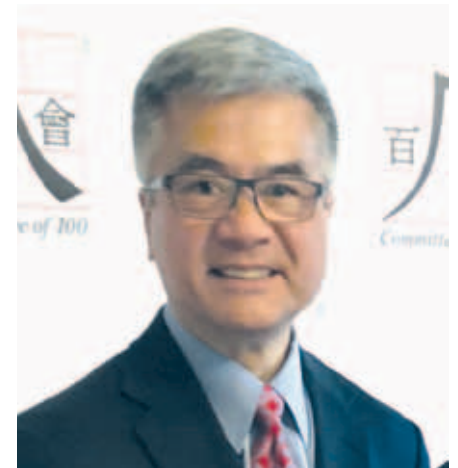
Gary Locke, former Governor of Washington.