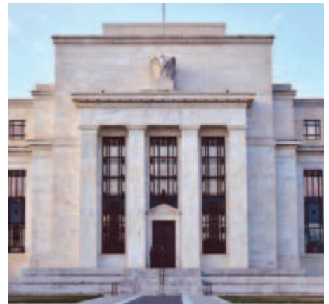
The European Central Bank in Frankfurt Germany (left) and the Federal Reserve Board Building (right) in Washington, D.C. have pumped in trillions to prop up the hopelessly bankrupt financial system, but hardly any into investments in the physical economy.