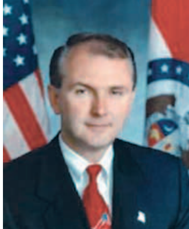
Missouri State Treasurer's Office