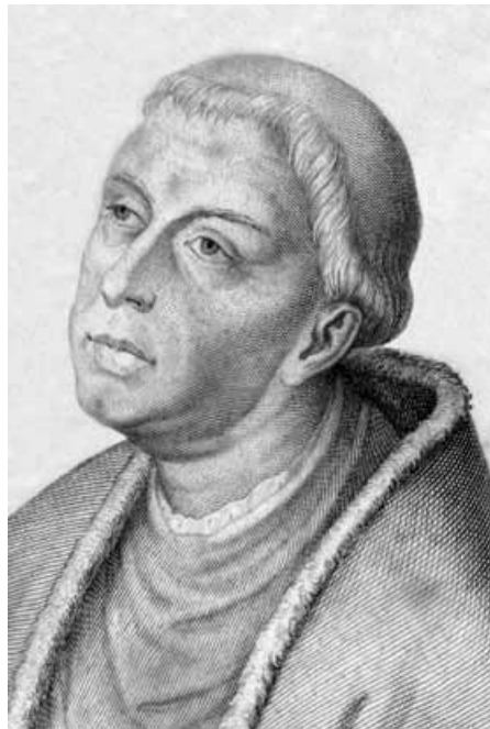
Cardinal Nicholas of Cusa (1401-1464).