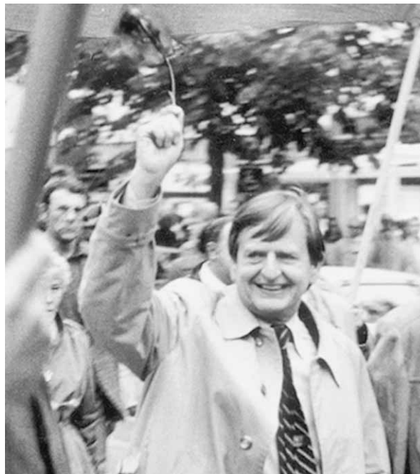
Beginning in the early 1970s, Lyndon LaRouche challenged the Swedish Model, a corporatist, anti-growth form of government of which Prime Minister Olof Palme, seen here, was then the standard bearer.