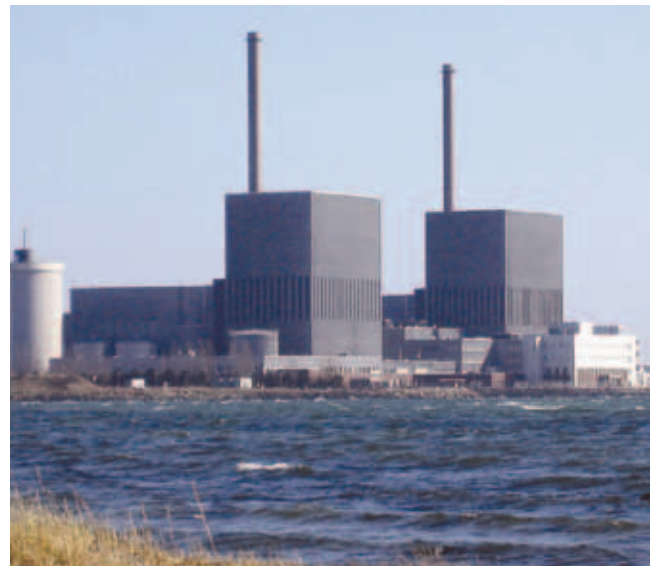
Palme's call for zero energy growth put a dead hand on the Swedish energy system, leading to the closing of three of twelve nuclear power plants. Shown is the Barsebäck Nuclear Power Plant in Skåne, now scheduled for demolition.