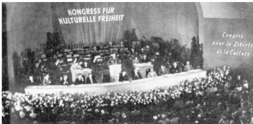
The founding conference of the Congress for Cultural Freedom in West Berlin, June 1950.

The LaRouche movement started to study and expose the Swedish Model whose anti-technological