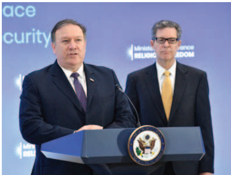
Pompeo with Sam Brownback, “Ambassador at Large for International Religious Freedom.”

Since 2018, when Brownback was appointed by Trump to a bizarre position called “Ambassador at Large for International Religious Freedom,” a position Brownback invented in a bill he passed right before retiring from the U.S. Senate, Pompeo and he are known to coordinate. One can find them, for example, hopping around conferences in Washington, D.C., where Brownback will have assembled terrorists and anarchists he gathers from all over the world, claiming they are being persecuted for their faith, whom they will even inflict personally on Donald Trump with visits to the Oval Office. Brownback’s shenanigans on this matter are proven to be fraudulent when compared to serious interventions that have been undertaken by clergy and other patriots, who have worked with Russia and China