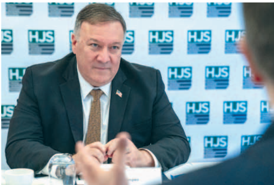
U.S. Secretary of State Michael Pompeo, in a roundtable discussion hosted by the Henry Jackson Society in London, July 21, 2020.

The character of that deep moral insanity, which causes him (reminiscent of British stooge Barack